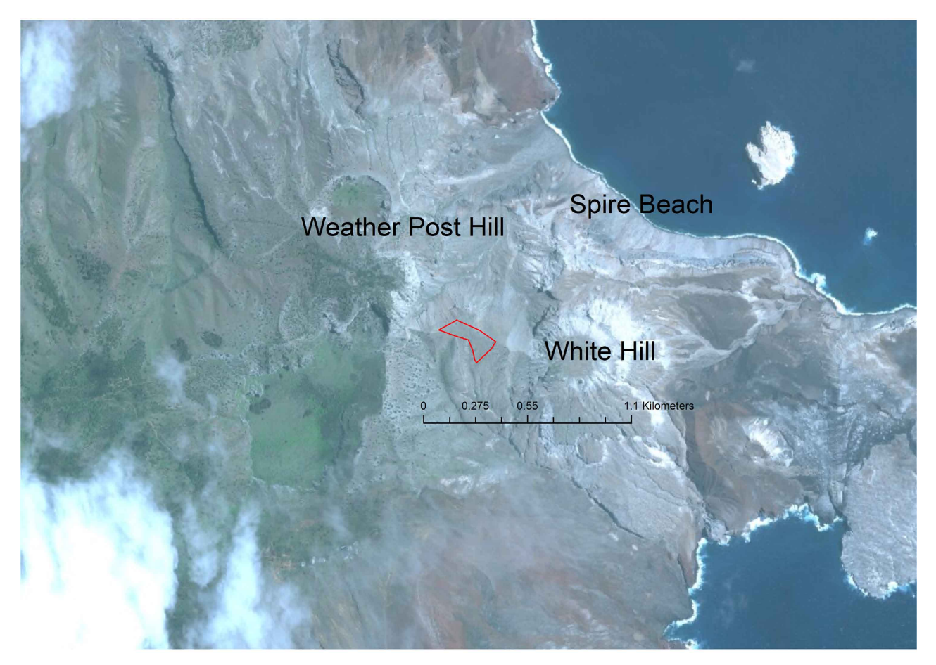
FIGURE 3. Boundary of the type locality for Cyperus stroudii marked in red and place names mentioned in the text.