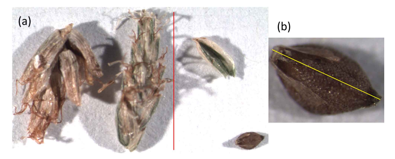
FIGURE 5. Close up of Cyperus stroudii characters (a) spikelets, glumes and nutlet (x 8 magnification red line is 6.4 mm) and (b) Nutlet(x 32 magnification yellow line is 1.6 mm).

Notes: Cyperus stroudii is in Cyperus sect. Turgiduli (C.B.Clarke) Kük. (Kükenthal 1935–36; Wilson 1991; Larridon et al. 2011). Morphologically, Cyperus stroudii is most similar to C. appendiculatus (Brongn.) Kunth, a species of the islands of the South Atlantic (Ascension, Fernando de Noronha, Trindade). These two species are sympatric on Ascension. In the type locality, C. stroudii can be quickly distinguished in the field because of its diminutive size, moving further afield it can be difficult to distinguish from C. appendiculatus because of the presence of intermediates and microscopic examination is required. The degree of any hybridisation and or environmental influence in the intermediate population has yet to be determined but should be a focus of a future revision of the entire C. appendiculatus group. The conservation of C. stroudii is also in need of some urgent action. The single population is extremely vulnerable to invasive species and stochastic events that could easily render the population extinct. A small ex situ collection exists in Edinburgh but we would recommend further seed collection and the establishment of on island cultivated material as well as a collection housed in the Millennium Seed Bank.