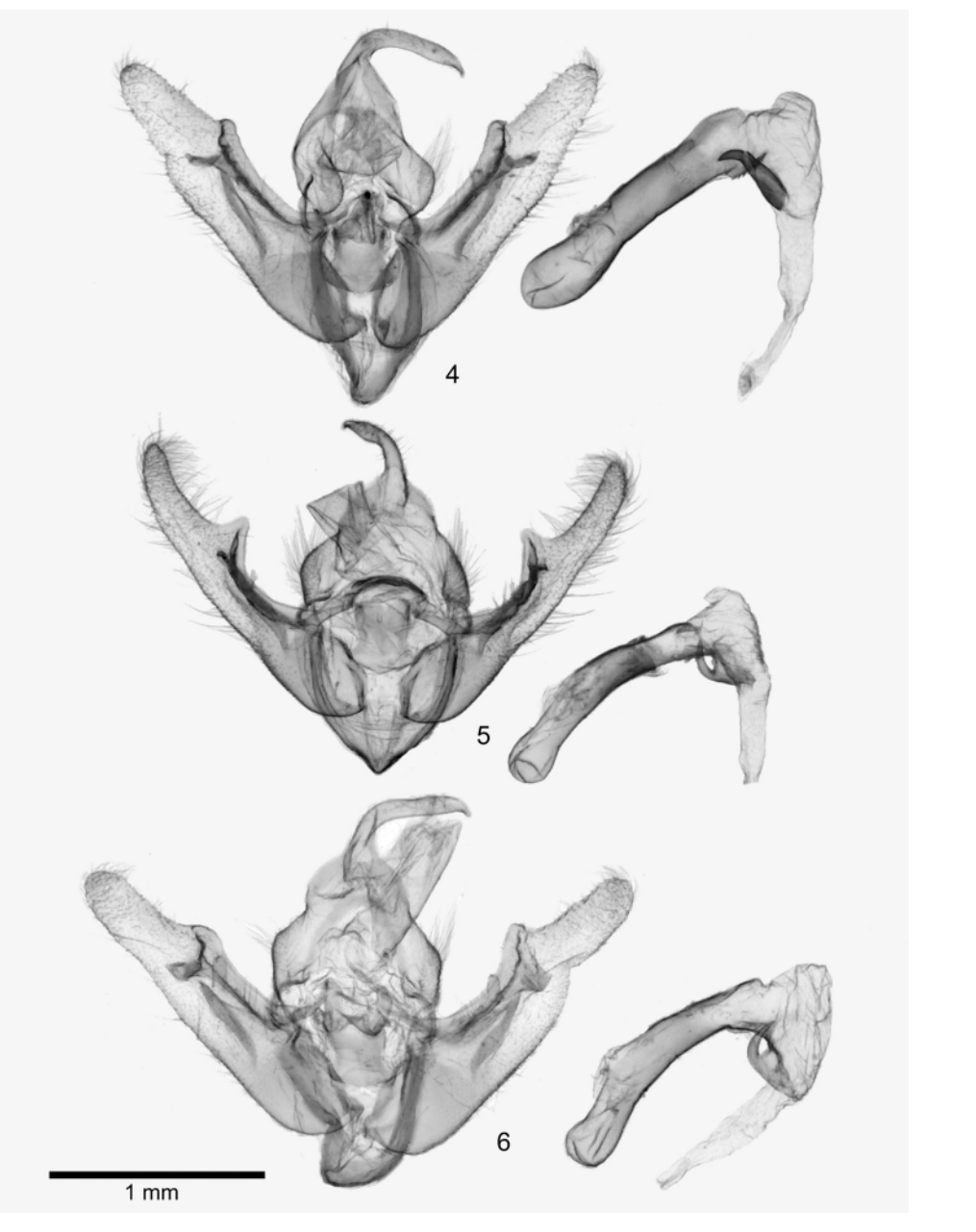
FIGURES 4-6. Male genitalia of Euros species. 4, E. proprius; 5, E. osticollis; 6, E. cervina.

Distribution and habitat. Euros osticollis occurs along streams and seeps in association with Darlingtonia californica Torr. (Sarraceniaceae) in southwestern Oregon. The larval host plant is unknown, but the presence of Darlingtonia in a wetland indicates the proper habitat for this species.