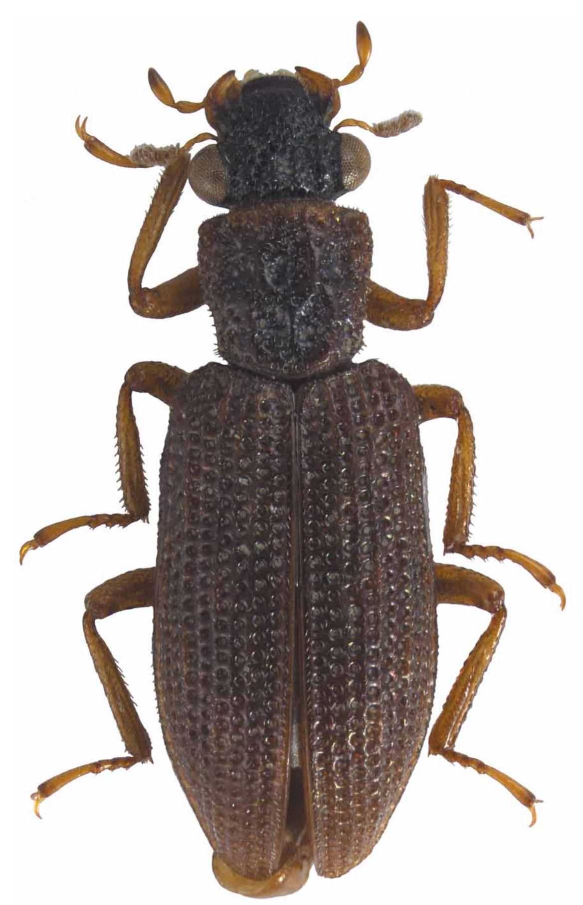
FIGURE 1. Hydrochus farsicus, habitus (Holotype).