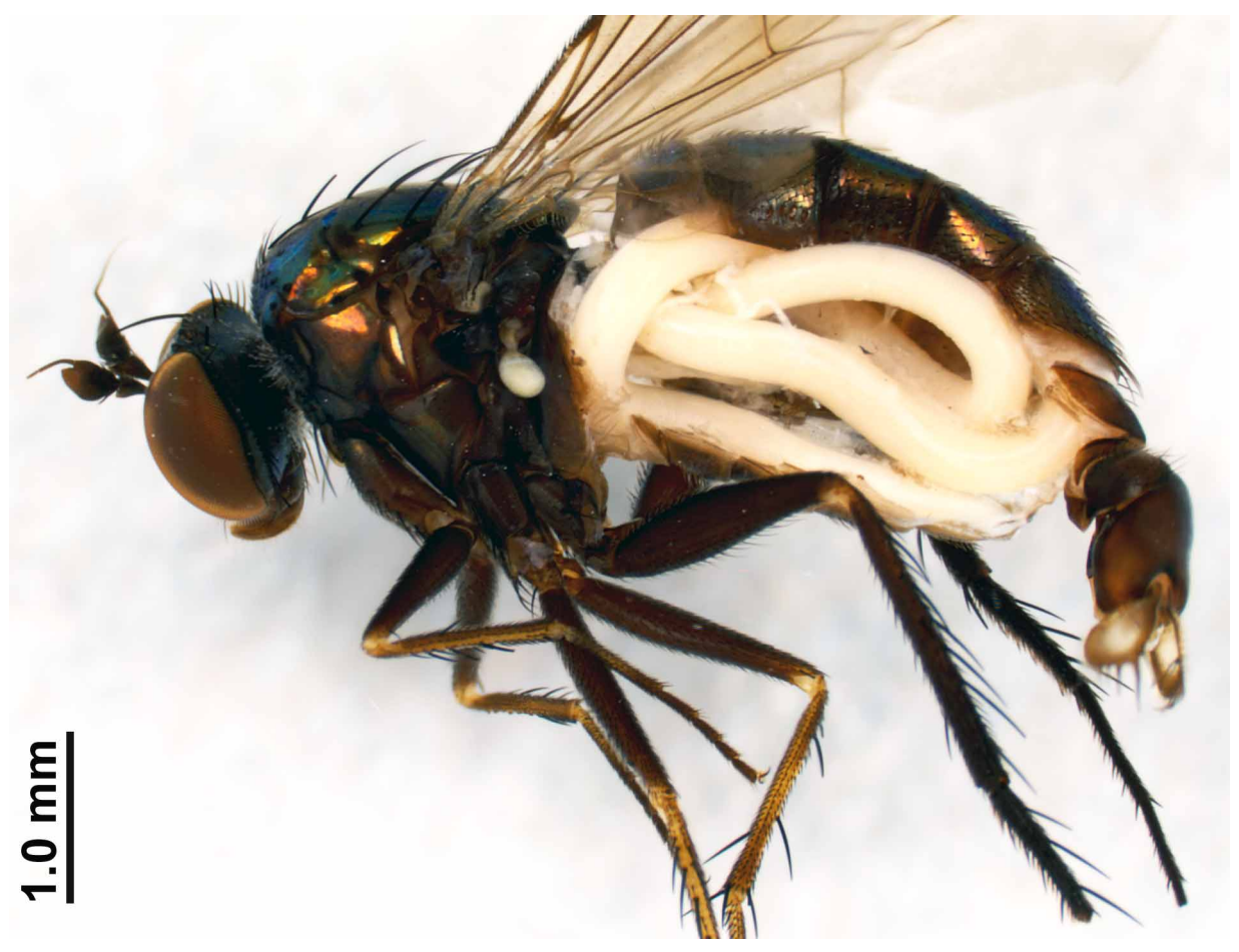
FIGURE. 3. Parasitic nematodes inside the abdomen of a male specimen of Dolichopus "cruralis" ( D. l. lepidus ) from Switzerland, Ticino, Olivone, Campra di Là, 1425 m a. s. l., 24.VI.1993 (MCSN).