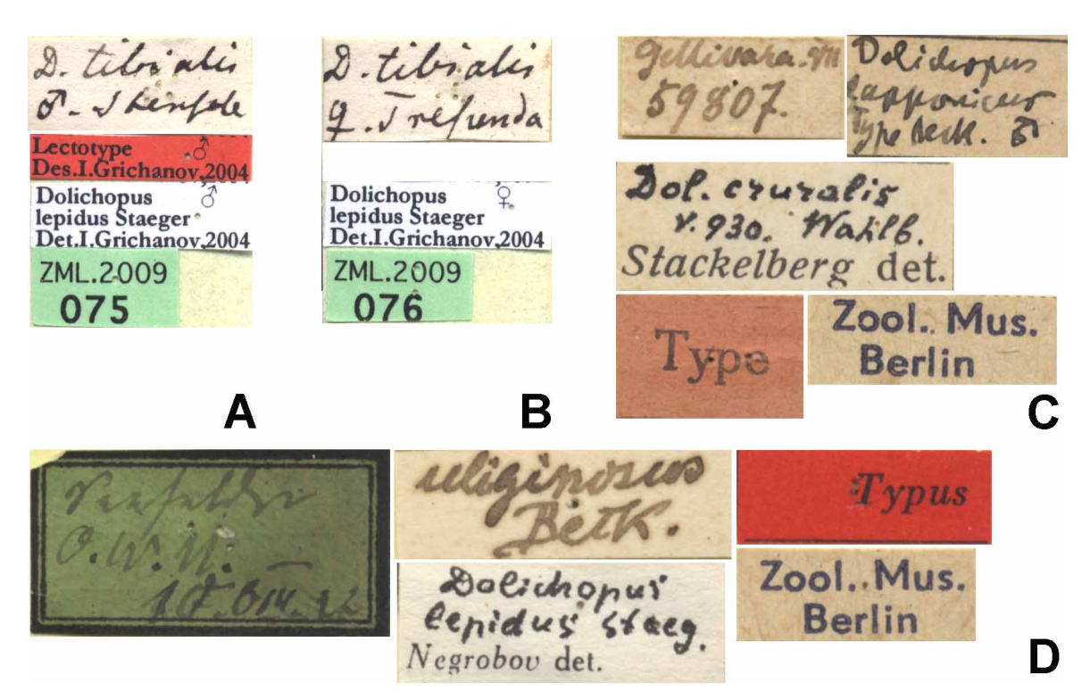
FIGURE. 1. Labels of investigated type specimens of synonyms of Dolichopus l. lepidus : (A) D. tibialis lectotype, Stensele, Sweden; (B) D. tibialis paralectotype, Tresunda, Sweden; (C) D. lapponicus lectotype, Gellivara, Sweden; (D) D. uliginosulus , lectotype, Seefeld, Germany [?].

However, all subsequent authors after Zetterstedt (1843), such as Kertész (1909), Lundbeck (1912), and Becker (1917) listed D. tibialis as a junior synonym of D. lepidus , whereas only Kertész (1909) followed Loew's (1857) view, and mentioned the mixed type series of D. tibialis by indicating "p. p." (pro parte) after the species name.