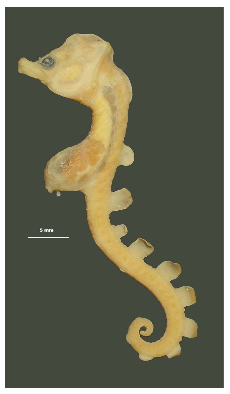
FIGURE 1. Holotype of Hippocampus paradoxus (scale bar = 5 mm).

Head prominent (HL 15.2% SL), axis approximately 90° to trunk axis; cleithrum particularly well developed and robust making head bulbous posteriorly; head deep, (HD 85.7% HL) rising steeply from short snout (SnL 25.5% HL) to a prominent supraoccipital; first nuchal plate also prominent dorsally, of similar height to supraoccipital, relative to horizontal axis of head and much higher than second nuchal plate; coronet only evident in radiograph as diffuse ossification, lying between supraoccipital and first nuchal plate and not in contact with supraoccipital; fleshy ridge-like crest extending posteriorly from supraoccipital, between gill openings, and over first nuchal plate; crest midway between supraoccipital and cleithrum—corresponding to position of coronet—the highest point on head (CH 50.0% HL); gill openings narrowly separated at top of head just anterior to cleithrum; cleithrum prominent laterally and dorsally, reaching to top of first nuchal plate; no cleithral ring evident on dermis.