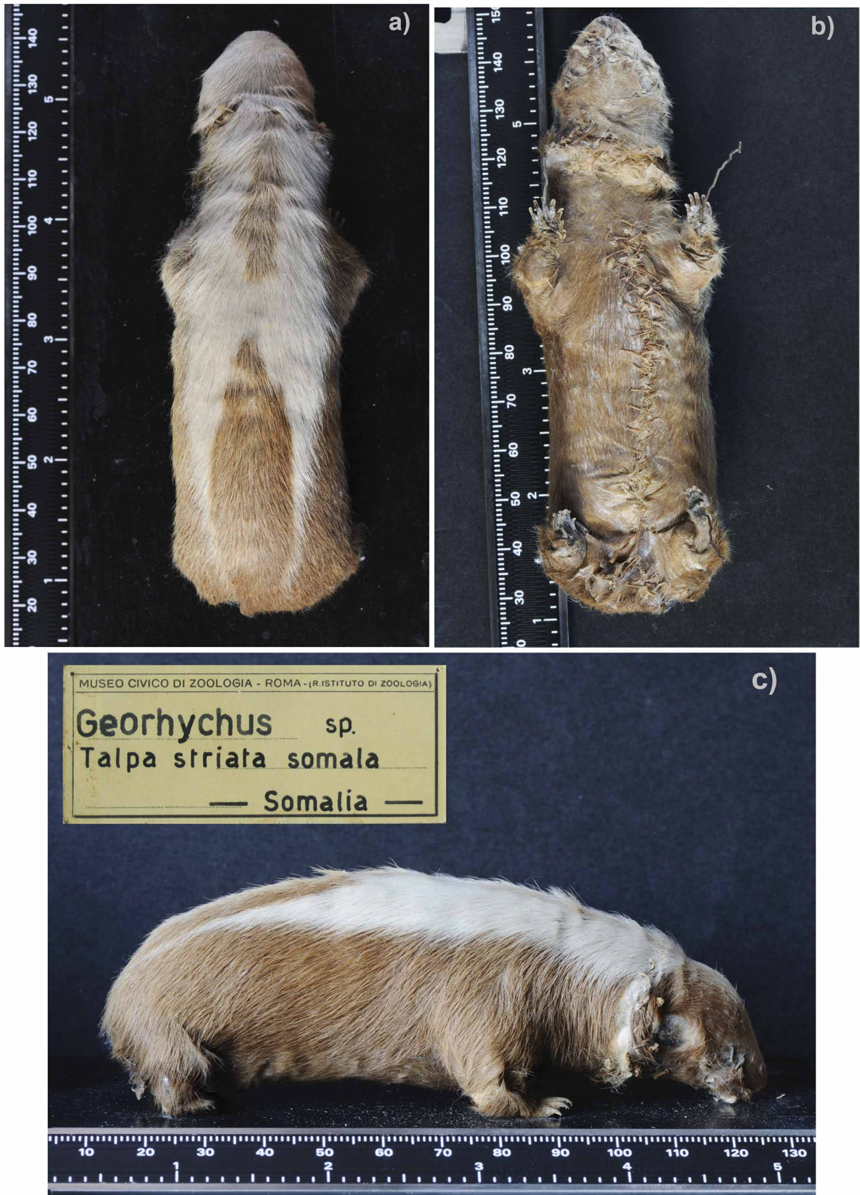
FIGURE 1. Holotype of Fukomys ilariae sp. nov. (MCZR 7016): a) dorsal view; b) ventral view; c) right lateral view and the original label of the specimen.