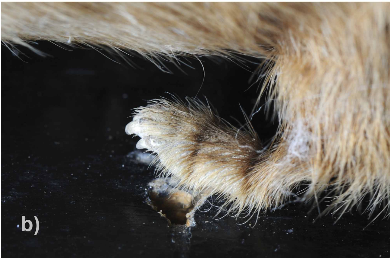
FIGURE 2. Detail of a) anterior foot and b) posterior foot from the holotype of Fukomys ilariae sp. nov. (MCZR 7016).