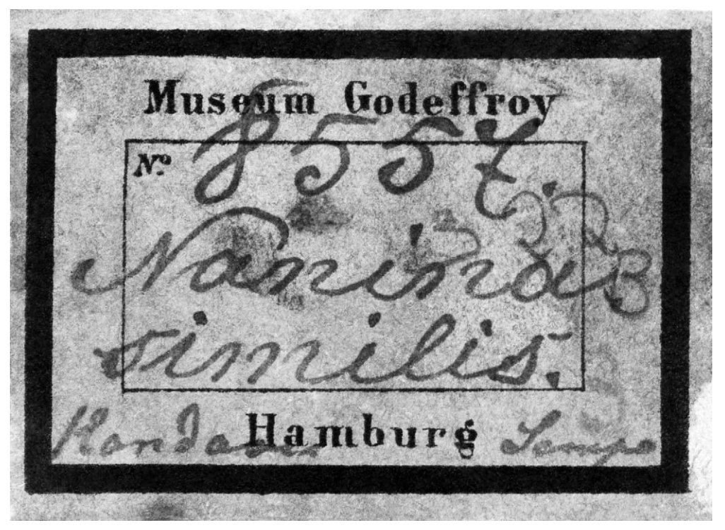
FIGURE 13. Museum Godeffroy specimen label (originally affixed to an alcohol vial). Godeffroy number 8557, stating " Nanina similis —Kandavu—Semper"; a syntype lot of Eurypus similis Semper, 1870 from Kandavu (Fiji), now as Orpiella ( Eufretum ) similis (C. Semper, 1870) in the Hamburg collection, ZMH 21477.

Some authors adopted the "Godeffroy numbers" consistently in formal publications, an example being Milne Edwards's (1873) treatment of Crustacea from the Godeffroy Museum.