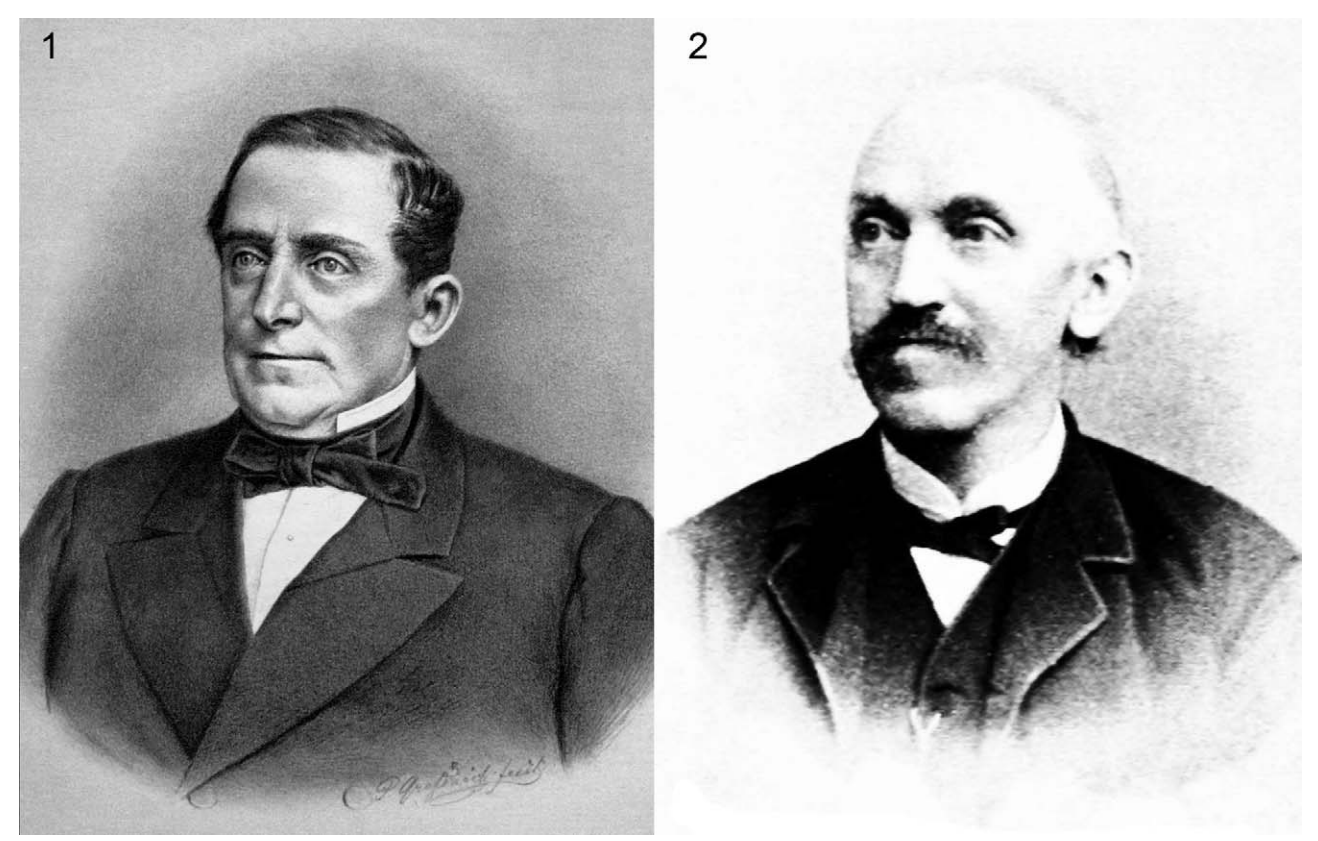
FIGURE 1, 2. Portrait of Johan Cesar VI Godeffroy, founder of the Museum Godeffroy (from Schmack 1938). Figure 2. Portrait of Johan Dietrich Eduard Schmeltz, curator of the Museum Godeffroy and editor of its Catalog series (from Starr 1892).

Hamburg's natural history collections, both private and public, have long benefitted from captains and sailors returning from exotic locales with biological and ethnographic specimens. The Hamburger Naturhistorisches Museum (discussed in more detail below) fostered and formalized relationships with individuals, shipping lines, and major trade companies in the city, resulting in massive collecting efforts around the world, its target regions usually directly reflecting Hamburg's commercial interests at the time (Panning 1957, 1958; Weidner 1969). Captains and other collectors on these vessels often were instructed in detail and sometimes equipped with appropriate tools, containers, and preservatives (Panning 1958: 18). The Godeffroys sponsored such efforts and, for instance, supported Gerhard Krefft, a collector for the Hamburger Naturhistorisches Museum, with free passage to Australia on a Godeffroy vessel (Panning 1956: 3). The material brought back to Hamburg fueled not only scientific investigation but also a lucrative trade of natural and ethnographic specimens that ultimately supported a series of display-based dealerships, of which the Godeffroy Museum became the most famous.