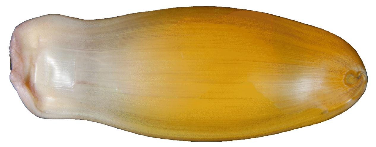
FIGURE 4. Egg capsule of Parmaturus pilosus , 79.55 mm × 30.76 mm × 15.68 mm with a 37.42 mm × 27.10 mm oval egg.

Notoraja tobitukai (Hiyama, 1940) Leadhued skate