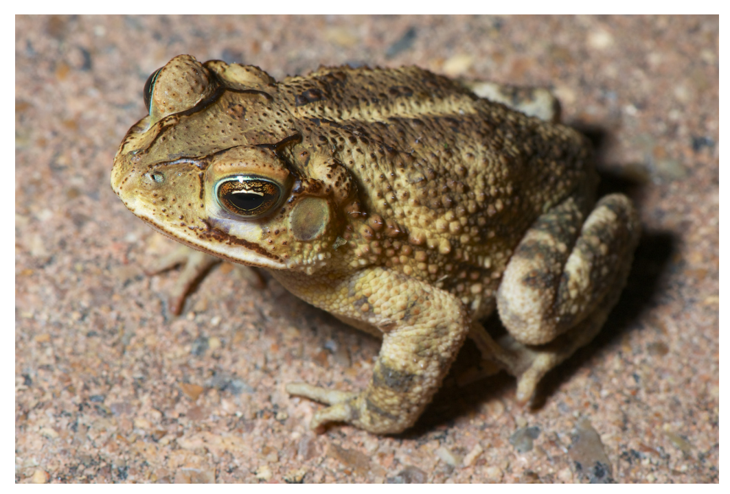
FIGURE 2. Incilius nebulifer, in life. An adult male photographed in the wild in Harris County, Texas, USA, by Matthijs Hollanders.