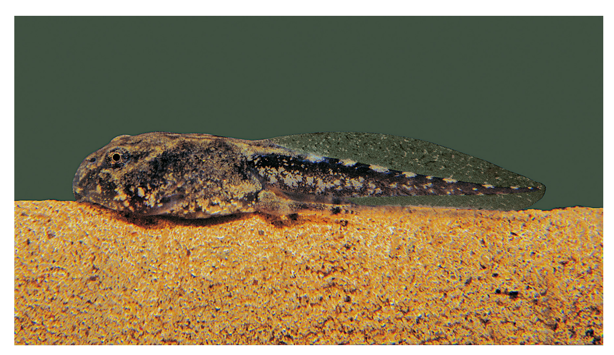
FIGURE 3. Incilius nebulifer; in life. A larval tadpole; image reproduced from Altig et al. (1998).

most individuals having dark brown dorsal and dorsolateral background coloration, with a broad cream or yellow mid-dorsal stripe and paired dorsolateral stripes (usually ventral to the lateral row of tubercles) of a similar pale color. No individuals show a distinctive "dead leaf" color pattern dorsally. The tips of the digits are of a similar color to the rest of the digit.