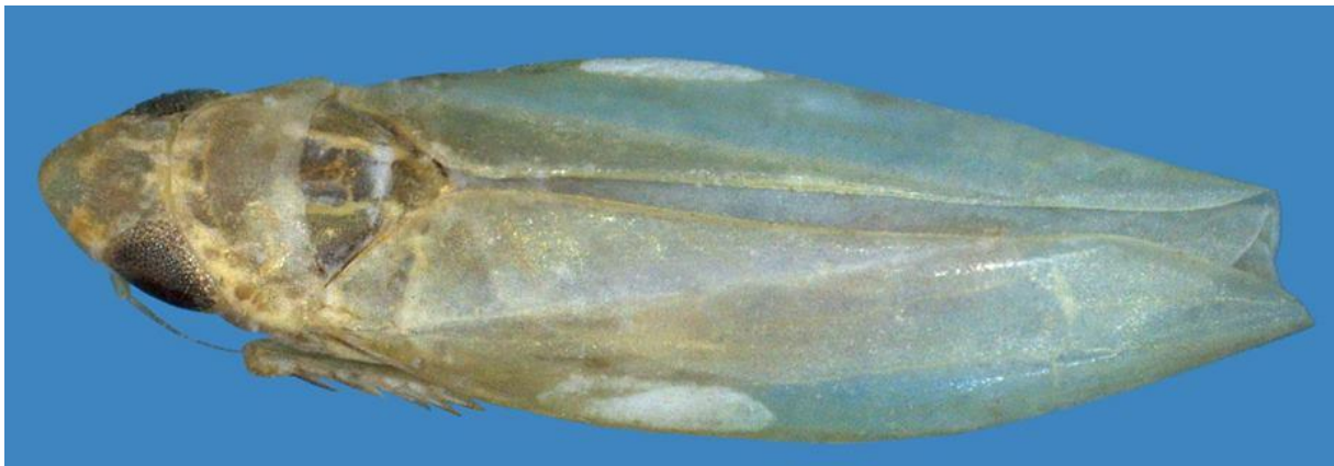
Figure 1. Kunzeana zantedeschia sp. nov., female, laterodorsal view.

Male: Total length 3.1–3.2 mm. Color pale-yellow (Fig. 1). Head with anterior margin rounded, moderately pronounced; crown with interocular width approximately equal to median length; anterior margin with a rounded yellow spot between median line and inner edge of eye (closest to eye); posterior margin whitish-yellow with diffuse irregular longitudinal band halfway up crown each side of median line. Eye brown. Pronotum with whitish lateral edges; median length approximately 1.3 times median length of crown, maximum width about 1.5 times median length, laterobasal angles far exceeding width of head. Mesonotum yellowish-brown, anterolateral angles and posterior margin whitish-yellow; two yellow-white diffuse irregularly contoured longitudinal stripes (each side of median line). Scutellum yellowish-brown; yellow-white spot (each side of median line) along anterior margin, in continuation to the mesonotal stripes. Forewing (Fig. 2A) yellowish, apical contour smoky-brown; apical cells narrow and elongated, apical cell II narrower than adjacent cells, apical cell III narrower in base than in apex, outer apical cell shorter, not attaining wing apex; claval area white. Hind wing (Fig. 2B) with CuA 2 free from a more apical point than MP 2 .