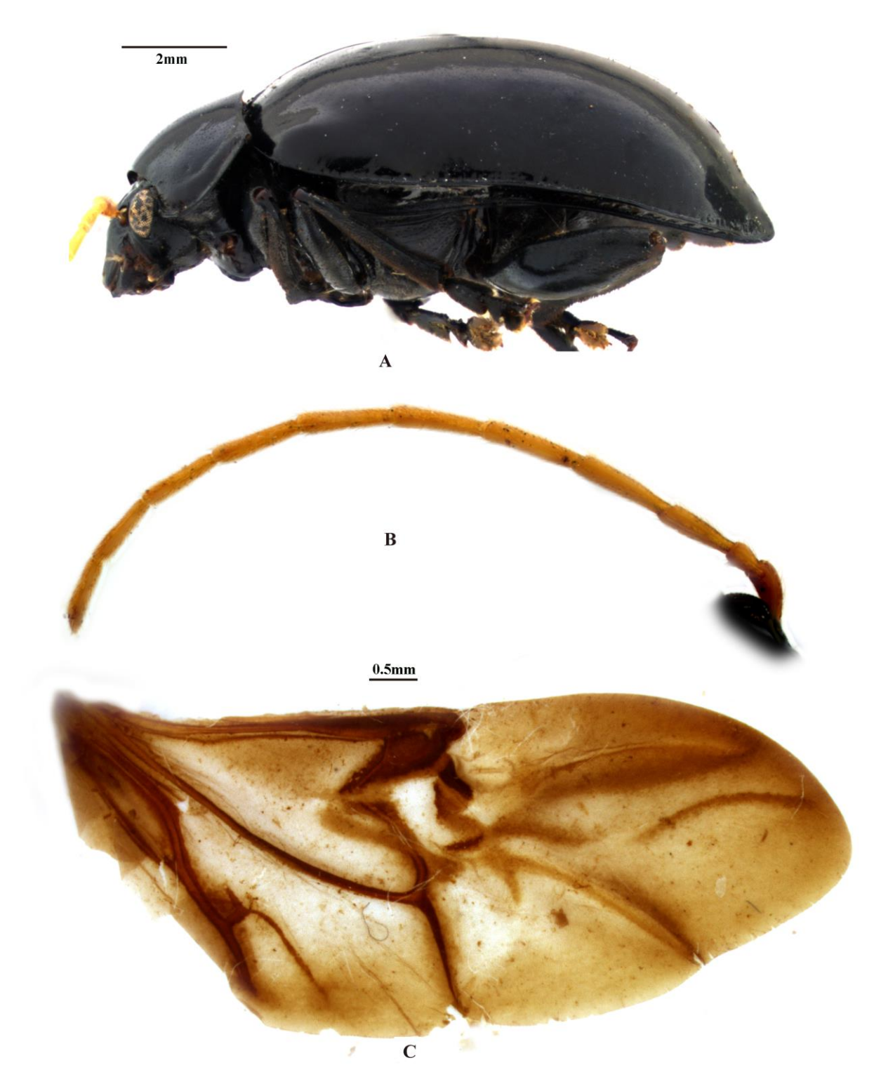
Figure 3. Allenaltica flavicornis sp. nov. A, lateral habitus; B, antenna; C, wing.

antenna not reaching middle of elytra with thicker distal antennomeres in Acrocrypta (antenna reach middle of elytra and the distal antennomeres are thinner than the middle ones in Allenaltica gen. nov.), deep supracallinal sulcus in Acrocrypta (supracallinal sulcus shallow in Allenaltica gen. nov.), closed procoxal cavities in Acrocrypta (procoxal cavities