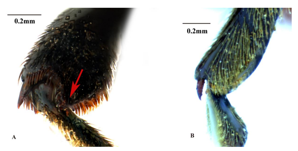
Figure 4. Apex of metatibia in ventral view. A, Allenaltica flavicornis sp. nov.; B, Sphaerometopa acroleuca (Wiedemann, 1819).

Etymology: The species name, flavicornis , refers to the color of the antenna.