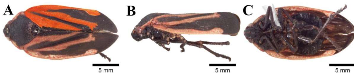
Figure 2. Adult female of Mahanarva jurael sp. nov. A , dorsal view (the color of the right tegmen was edited); B , lateral view; C , ventral view.

Remarks: This species is characterized by the thick red lines, one on the clavus and two on the remigium; the last two, extend to three quarters of the tegmina, one parallel to claval suture and other on costal vein; also the structures in male genitalia are unique.