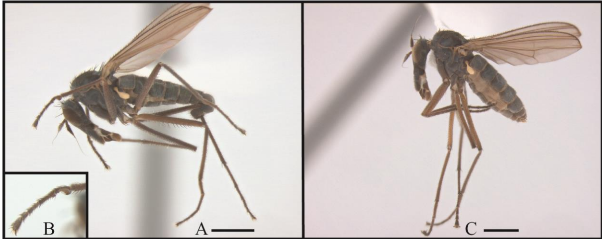
Figure 1. Thambemyia fusariae sp. nov., habitus. A , male habitus; B , detail of male fore tarsus; C , female habitus. Scale bars: 1,0 mm.

tibiae lighter; hind tibia and femur without conspicuous setae. Abdominal segments 6 and 7 exposed (not retracted under segment 5), tergites lighter and covered with short setae. Ovipositor (Fig. 2B). Tergite 10 divided into two acanthophorites and bearing 2 slender medial spines and 1 lateral seta each.