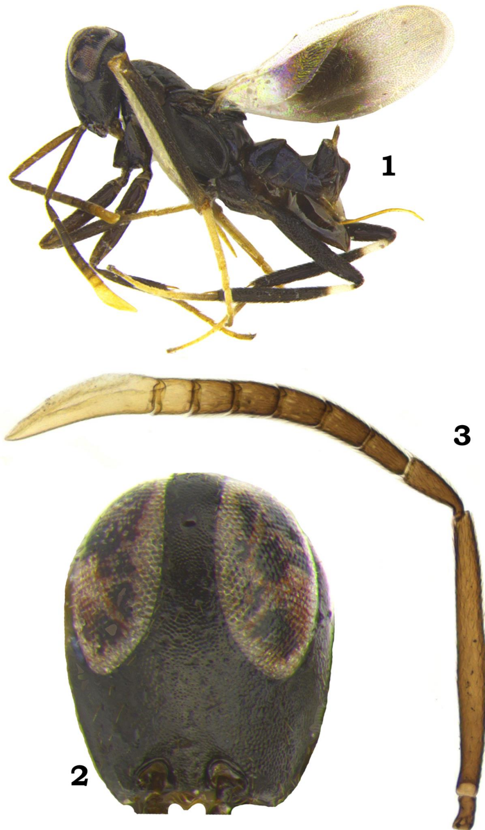
Figures 1–3. Copidosomyia abdulkalami Manickavasagam & Krishnachaitanya sp. nov. , holotype (♀). 1 , habitus image; 2 , head frontal view; 3 , antenna.