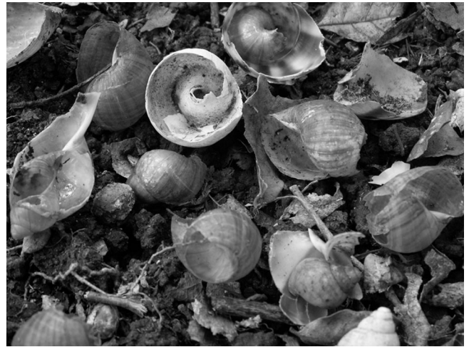
FIGURE 3. Rodent-damaged Placostylus shells are easily identified by the broad spiral band of shell removed from one or more whorls.

In New Zealand, predation by introduced pigs, rodents, and birds has also been implicated in the decline of the Placostylus species there, along with habitat destruction and modification by farming and burning (Penniket 1981; Parish et al. 1995; Sherley et al. 1998).