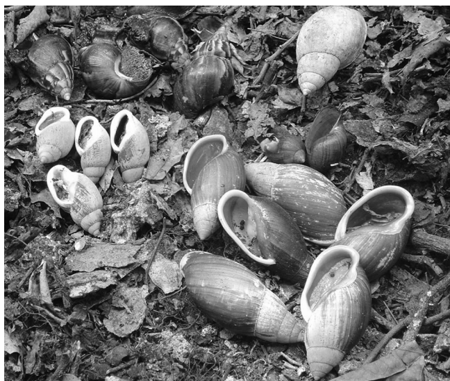
FIGURE 2. Morphological differences between the New Caledonian endemic snails Placostylus fibratus (bottom) and Placostylus porphyrostomus (middle), and the introduced snail Achatina fulica (top).

Placostylus fibratus reaches maturity at five years and, based on a prediction of shell growth rates, it is suggested that they may live 15 years and attain 11.7 cm shell height (Pöllabauer 1995). Once maturity is reached, the increase in shell height stops, but thickening of the peristome continues (Pöllabauer 1995). Adult P. fibratus are thus characterised by a shell with a thickened apertural lip (more than 4 mm) which is also strongly correlated with the maturity of the genital tract ( r = 0.70 for female organs and r = 0.60 for male organs) (Pöllabauer 1995).