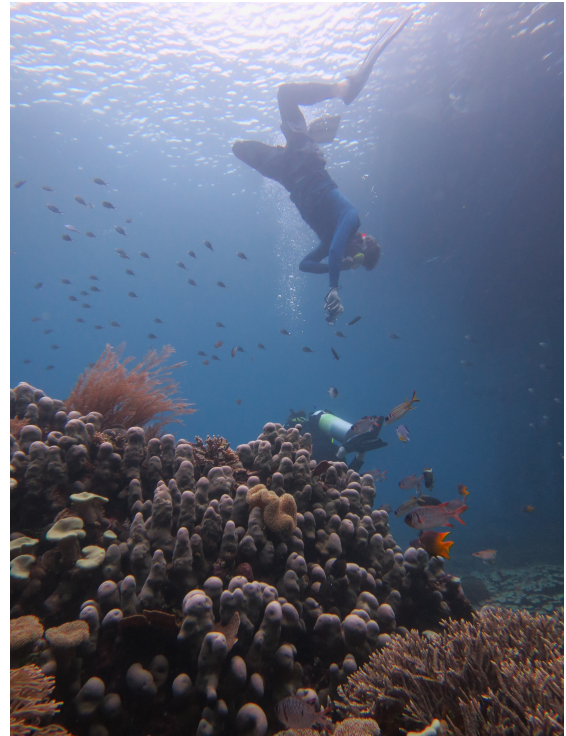
FIGURE 2. The author as a naturalist exploring marine biodiversity in Raja Ampat, Indonesia, the richest place for species in the oceans.