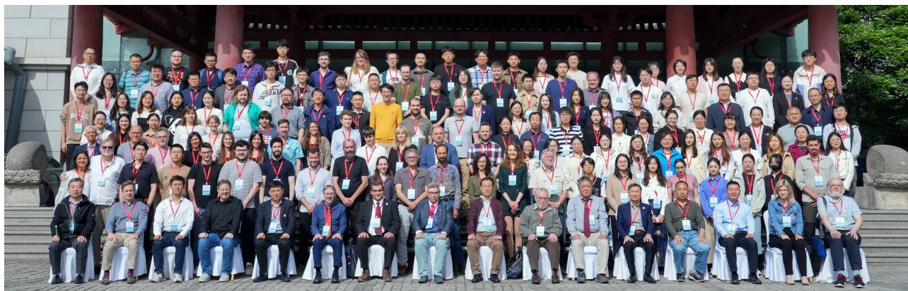
FIGURE 1. Group photo of the 9 th International Conference on Fossil Insects, Arthropods and Amber.