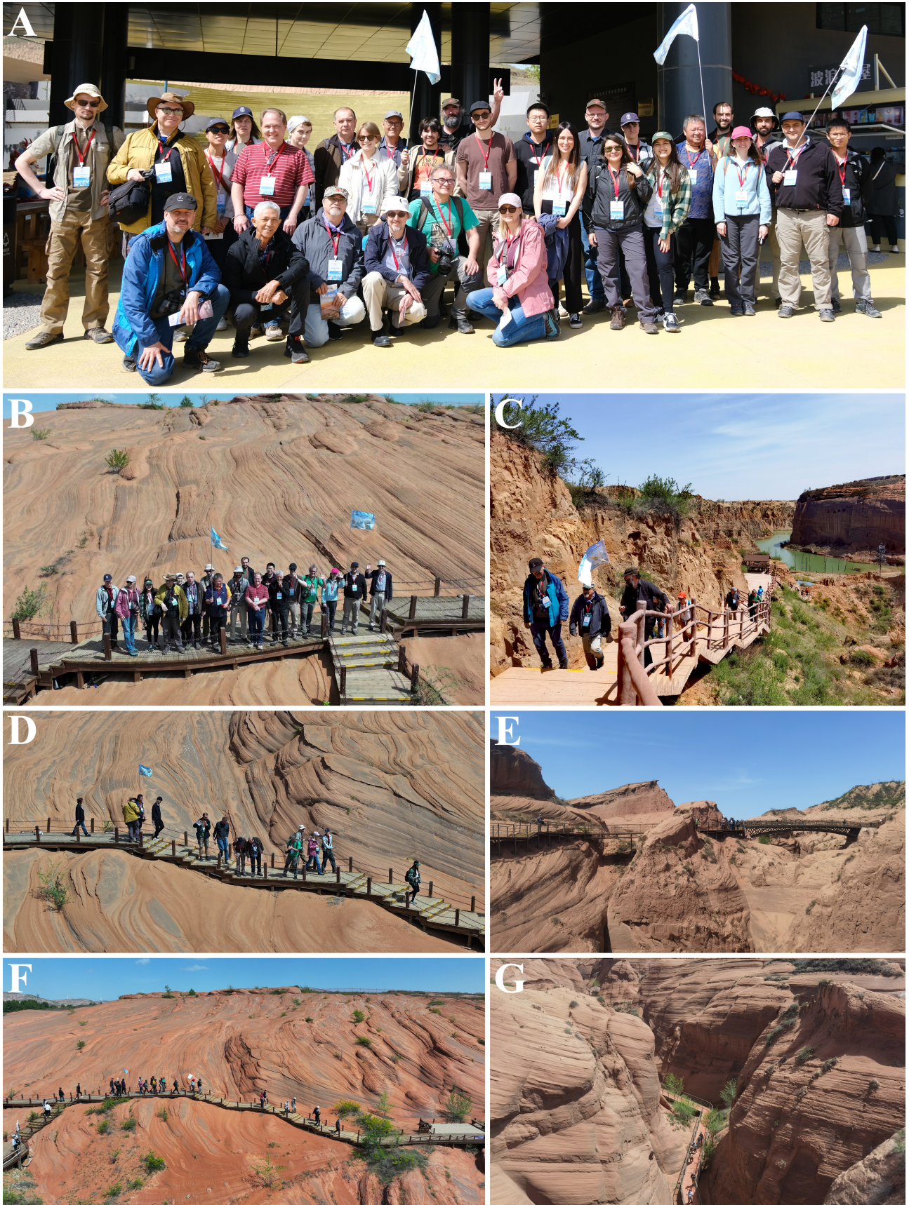
FIGURE 4. Visiting Longzhou Danxia Geopark in Jingbian County, Yulin City, to investigate aeolian deposits of the Lower Cretaceous Luohe Formation.