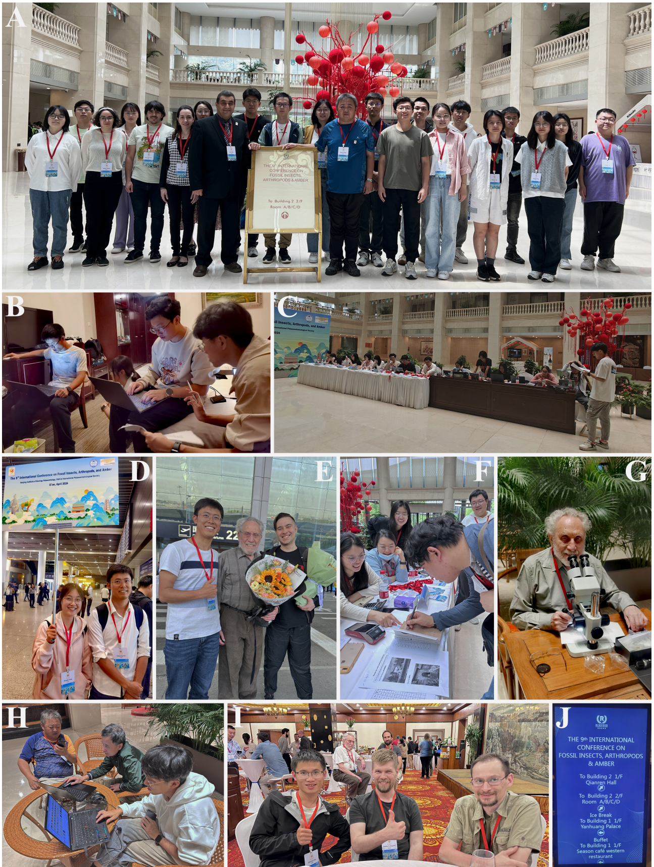
FIGURE 2. Conference highlights. A , Group photo of the Organizing Committee. B , Midnight preparation meeting. C , Registration desk. D , E , Airport pick-up. F , Check-in. G , H , Late-night research and discussions in the hotel lobby. I , Icebreaker. J , Conference sign board.