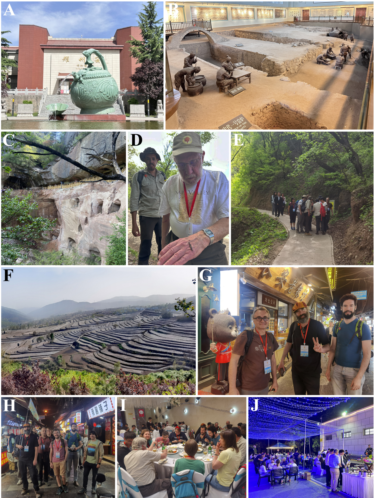
FIGURE 7. Mid-conference field trip. A , Visit to the Yaozhou Kiln Museum. B , Visit to Tang and Song dynasties kiln sites. C , Visit to the contact surface between the Middle-Late Jurassic Zhiluo Formation and the Lower Cretaceous Yijun Formation at the Yuhuangong Park. D , E , Arthropod catching. F , Yijun dryland terraces. G , H , Night view of Xi'an. I , J , Conference dinner.