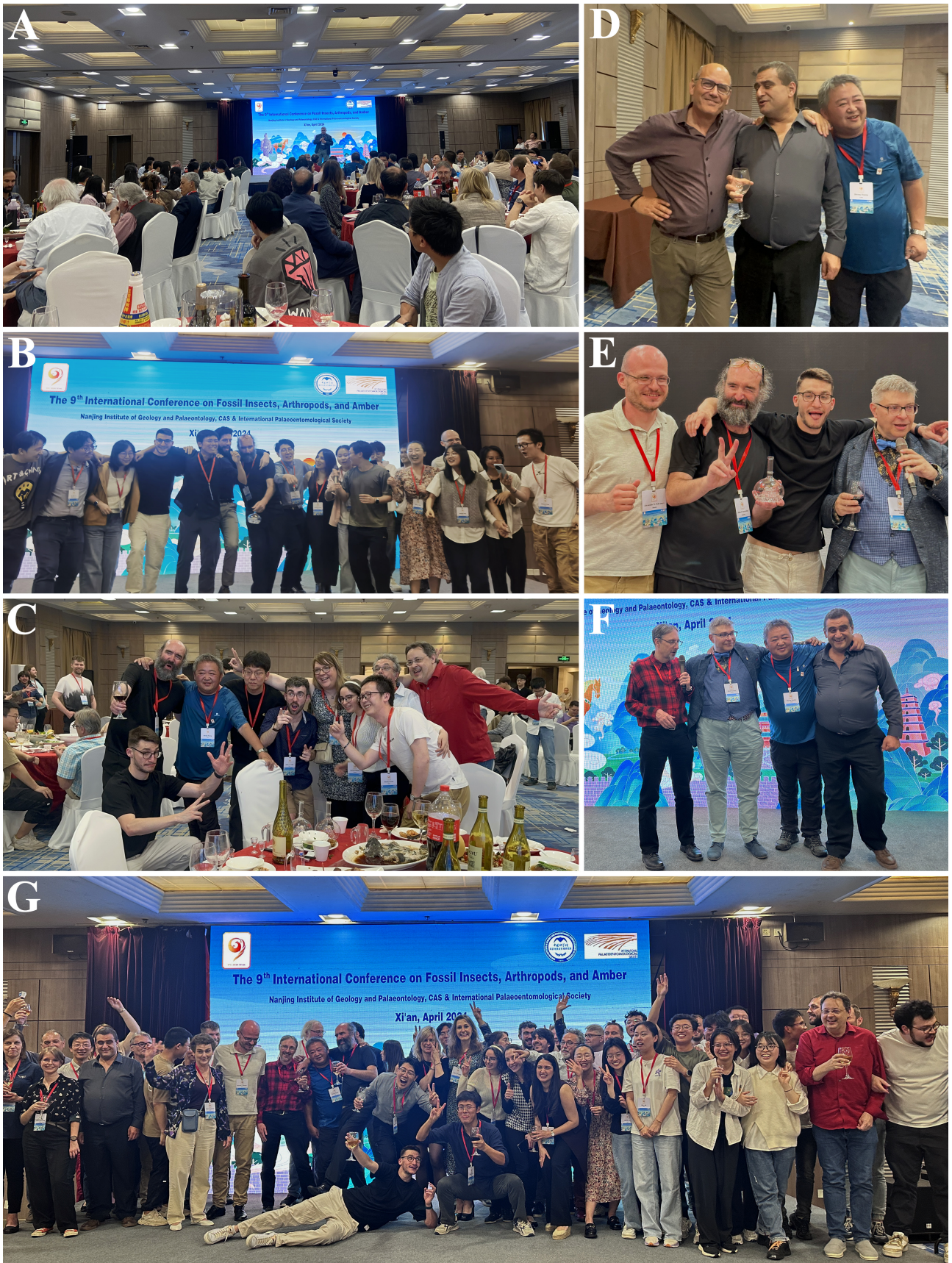
FIGURE 9. Joyous gathering, the Gala Dinner.