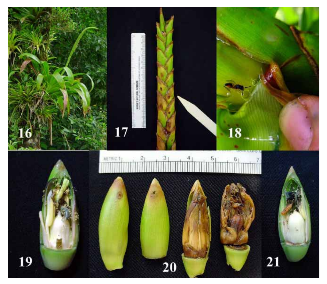
FIGURES 16–21 . Werauhia gladioliflora: 16, flowering specimen, in situ; 17, infested inflorescence; 18, male of E. werauhia drowned in bractal mucilage; 19, dissected floral bud with E. wer auhia larva; 20, floral buds with damage by E. werauhia : emergence holes and necrotic interiors; 21, dissected floral bud with E. werauhia pupa.

Host. —Reared from floral buds of Werauhia gladioliflora . Distribution. —Known from a single locality in Costa Rica.