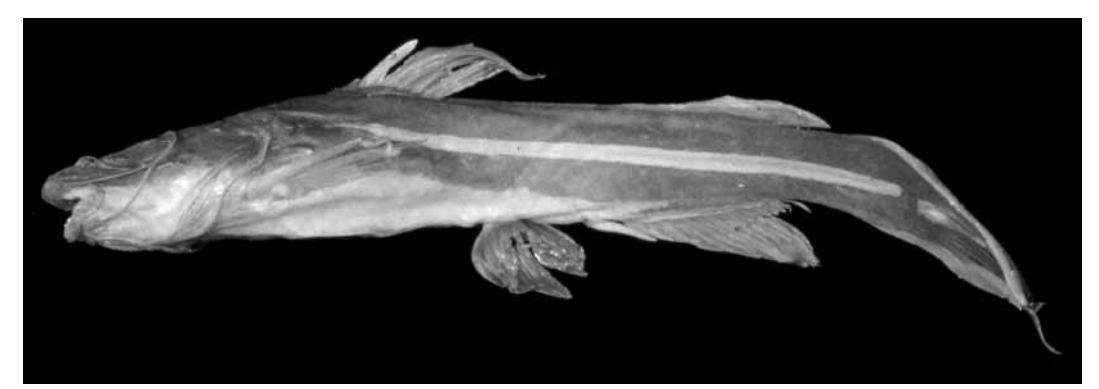
FIGURE 2. Pseudomystus mahakamensis, male, RMNH 7838, 84.6 mm SL.

tle lateral compression; body in shape of elongate cone, widest just behind pectoral fins. Dorsal profile rising evenly but not steeply from tip of snout to origin of dorsal fin, then gently sloping posteroventrally from that point to end of caudal peduncle. Ventral profile horizontal to origin of anal fin, then sloping posterodorsally to end of caudal peduncle. Dorsal origin nearer tip of snout than end of caudal peduncle. Dorsal spine stout, without serrations on posterior edge. Depressed dorsal fin not reaching adipose fin. Pectoral spine stout, with minute denticulations along nearly of all anterior edge and with 11–14 large serrae on posterior edge (Fig. 3a). Anal origin slightly posterior tovertical through adipose fin origin. Caudal fin forked; upper and lower lobes lanceolate, upper lobe about twice as long as lower, with upper simple principal ray very elongate.