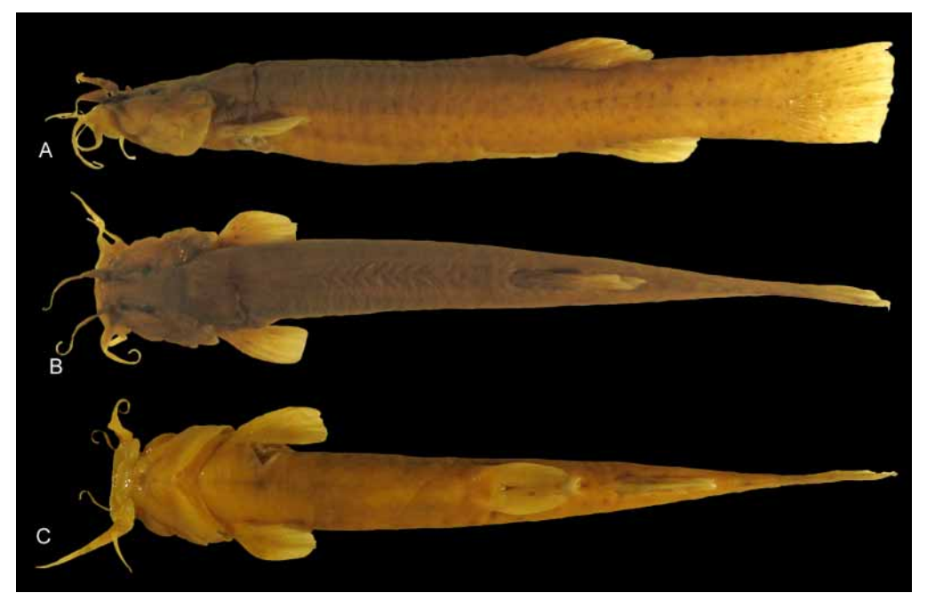
FIGURE 2. Trichomycterus guaraquessaba , Holotype, MPEG 7916, 89.1 mm SL, rio Bracinho, Fazenda Salto Dourado, Município de Guaraqueçaba, Paraná, Brazil: A) lateral, B) dorsal, and C) ventral views.

Etymology: The specific epithet " guaraquessaba " is derived from the name of Município de Guaraqueçaba and the Área de Proteção Ambiental de Guaraqueçaba (APA-Guaraqueçaba), the area of occurrence of the new species. A noun in apposition.