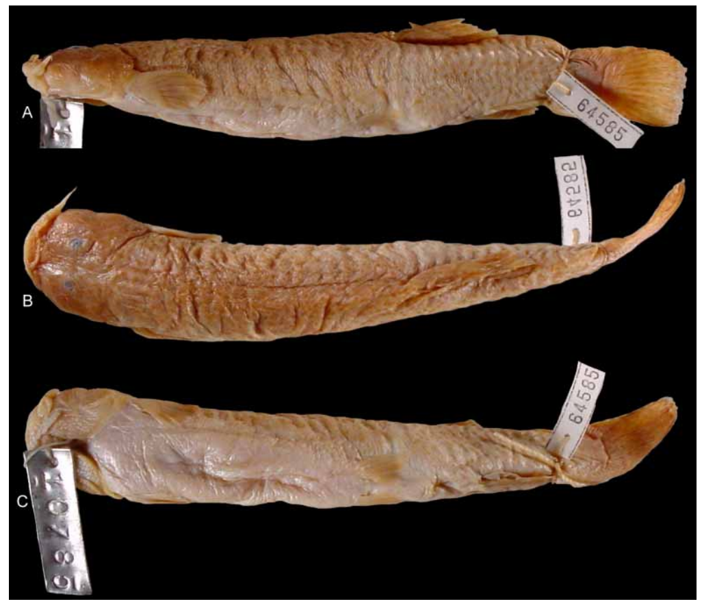
FIGURE 3. Trichomycterus iheringi, Holotype: CAS 64585 (ex IU 10785), 139.6 mm SL, Santos, São Paulo Brazil: A) lateral, B) dorsal, and C) ventral views..

specimens (Fig. 4). Mouth subterminal, its corners laterally oriented. Lower lip with conspicuous lateral fleshy lobes, internal to origin of rictal barbels. Anterior margin of upper lip rounded. Small papillae on external surface of upper lip; large papillae continuous inside of mouth to region of teeth attachment. Upper lip continuous with dorsal surface of head. Barbels long with large bases and gradually narrowing towards tip. Tips of nasal barbels reaching midway between posterior rim of eye and base of anterior opercular odontodes; tips of maxillary barbels reaching tip of posterior opercular odontodes; tips of rictal barbels reaching base of posterior most interopercular odontodes. Origin of nasal barbels on posterolateral portion of integument flap around anterior nostril. Interopercular patch of odontodes long, 20-22 conical odontodes covered by thick integument, anteriormost odontodes smaller and slightly curved medially, gradually longer and more curved distally. Opercular patch of odontodes rounded, covering posterior edge of opercle, 25-27 conical odontodes, anterior ones smaller and straight, gradually longer and curved distally. Supraorbital canal complete, infraorbital incomplete. Infraorbital anterior section pores i1 and i3, and posterior section pores i10 and i11. Supraorbital pores s1, s2 and s6 paired.