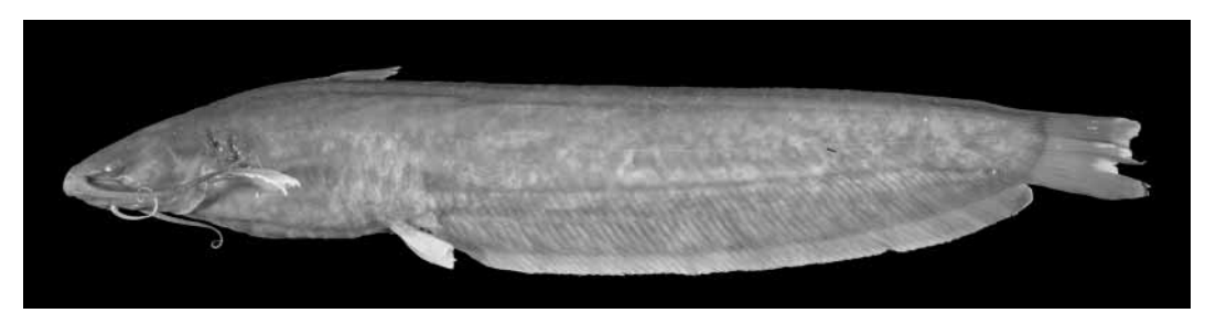
FIGURE 1. Pterocryptis anomala, HKU 286, 130.0 mm SL; Lantau Island.

ASIZB 72974 (1), 78.6 mm SL; China: Guangdong province, Chebaling Nature Reserve, 520 m a.s.l., 24°42'N 114°10'E, 17 Aug 2000. ASIZB 72975 (1), 104.4 mm SL; China: Guangxi province, Damingshan Nature Reserve, 23°27'N 108°26'E. CAS 130371 (1), 89.5 mm SL; CAS 131659 (1), 132.0 mm SL; Hong Kong. HKU 283 (1), 96.7 mm SL; Hong Kong: New Territories, Lau Shui Heung. HKU 284 (1), 114.8 mm SL; Hong Kong: New Territories, Ho Chung. HKU 285287 (3), 99.6–160.6 mm SL; Hong Kong: Lantau Island, Tong Fuk. HKU 288 (1), 110.4 mm SL; Hong Kong: Lantau Island, Sha Lo Wan. HKU 289 (1), 53.7 mm SL; Hong Kong: New Territories, Lau Guangdong province, Nanling Nature Reserve, Longtanjiao station, 350 m a.s.l., 25°0''N 112°0'E. KFBG 287 (1), 96.2 mm SL; China: Guangdong province, Guanyinshan Nature Reserve, 300 m a.s.l., 23°58'N 113°30'E. ZRC 45958 (1), 121.4 mm SL; Hong Kong: New Territories, Tai Shui Hang. USNM 293933 (1), 68.5 mm SL; China: Guizhou province, Beipanjiang.