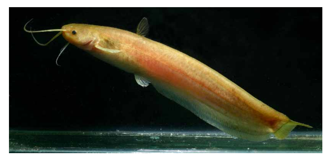
FIGURE 3. Pterocryptis anomala , ca. 150 mm SL, Guangdong province, showing live coloration of this species (specimen not preserved).

Colour in life similar, except for more variation (yellow, brown or greenish) and lack of dark patches on dorsal surface and sides of head (Fig. 3).