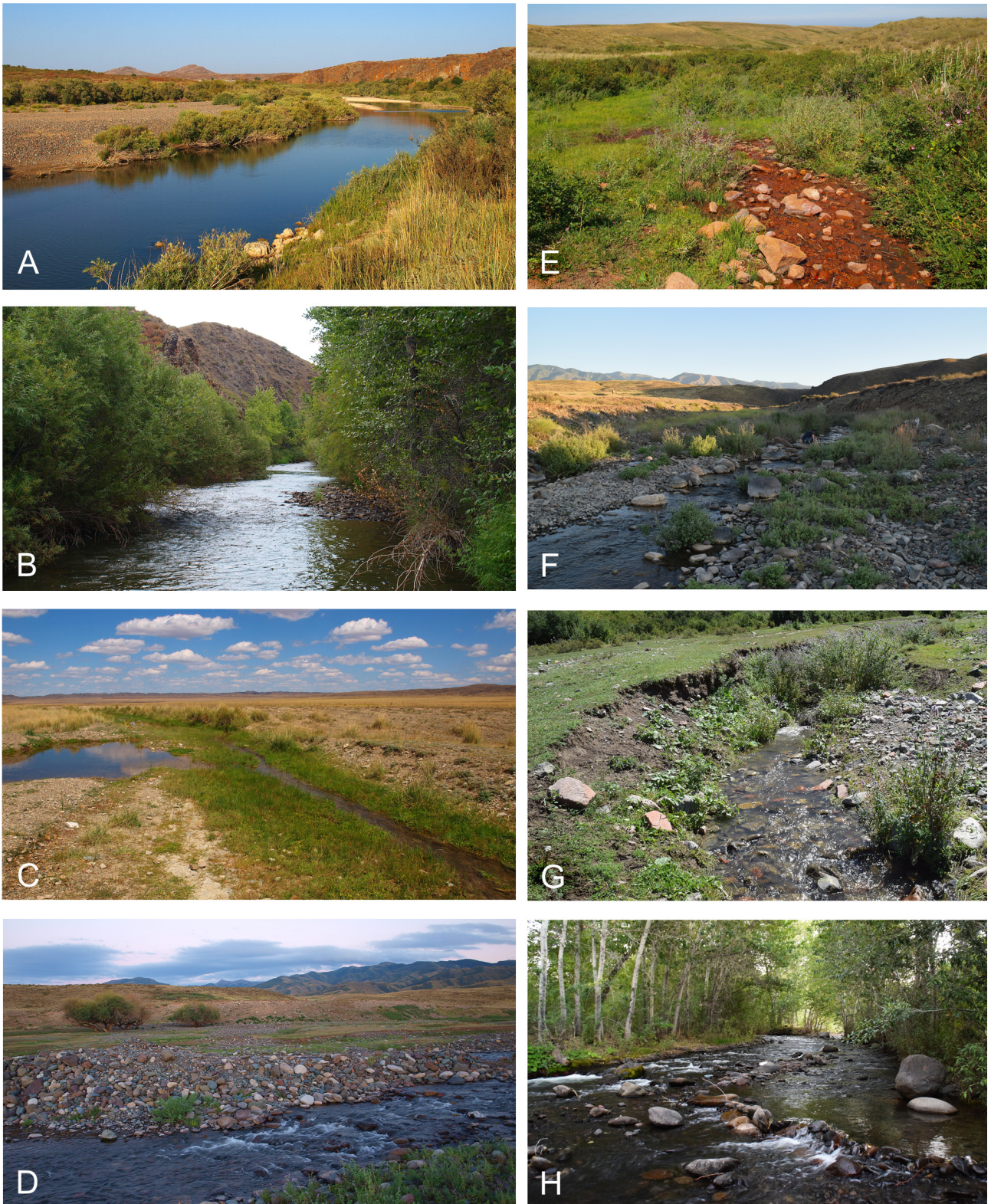
FIGURE 2. Biotopes of the localities: 2A, Tarbagatay Range, Ayagoz River upstream of Novyi Mailin village (Loc. 1); 2B, Tarbagatay Range, Bazar River (Loc. 2); 2C, Tarbagatay Range, Sary-bulak Brook (Loc. 4) running across the dry steppe; 2D, Saur Range, Bolshoy Jameney River (Loc. 5); 2E, Saur Range, Kyzylbulak Spring (Loc. 6); 2F Saur Range, Temirsu River (Loc. 7); 2G, Saur Range, Terekty River (Loc. 8); 2H, Saur Range, Jameney River (Loc. 9).