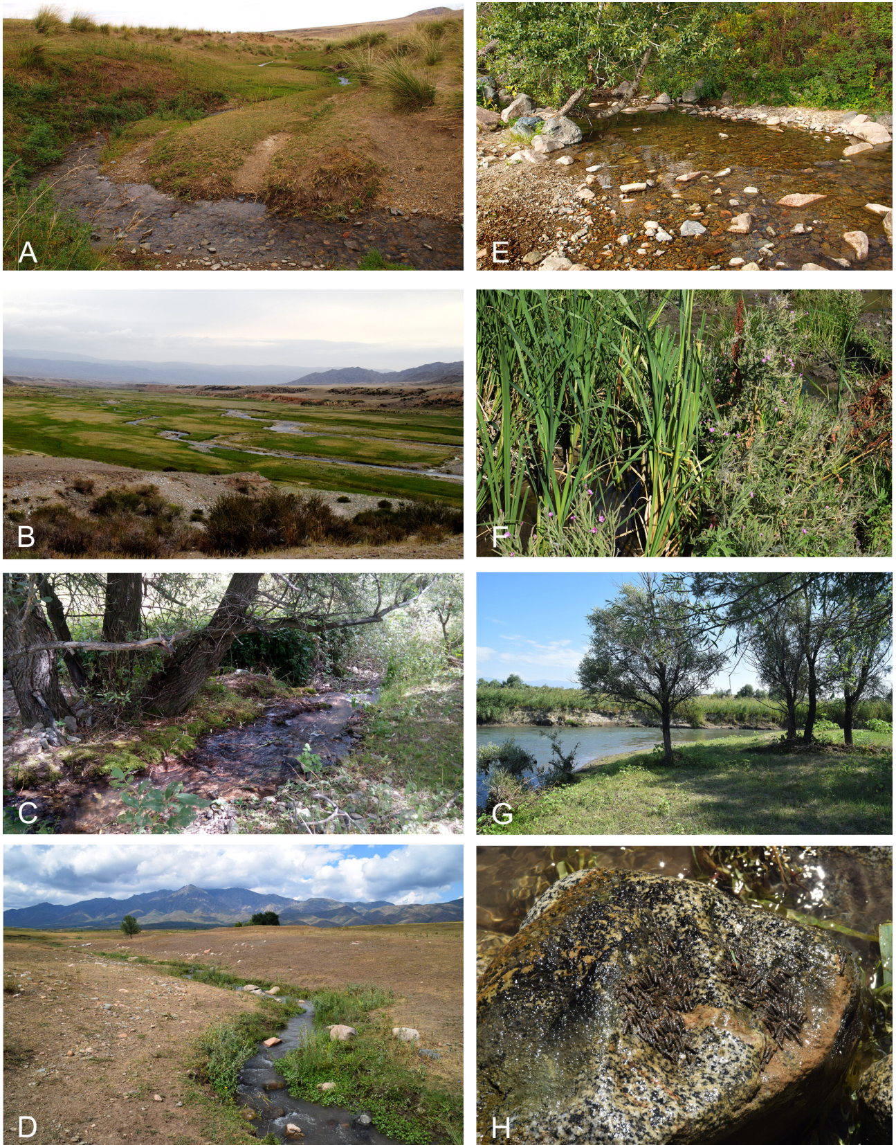
FIGURE 3. Biotopes of the localities: 3A, Tarbagatay Range, Shengelbay Creek (Loc. 10); 3B, Tarbagatay Range, Shet Lasty River (Loc. 11); 3C, Tarbagatay Range, spring 15 km NE Urdzhar village (Loc. 12); 3D, Tarbagatay Range, Taldy-Bulak Brook (Loc. 13); 3E, Tarbagatay Range, Kishkentau River (Loc. 14); 3F, Tarbagatay Range, Kyzylbulak Spring (Loc. 15); 3G, Tarbagatay Range, Urdzhar River (Loc. 16); 3H, Apataniana cornuta , groups of pupae on a stone taken out of the water, Tereky River (Loc. 8).