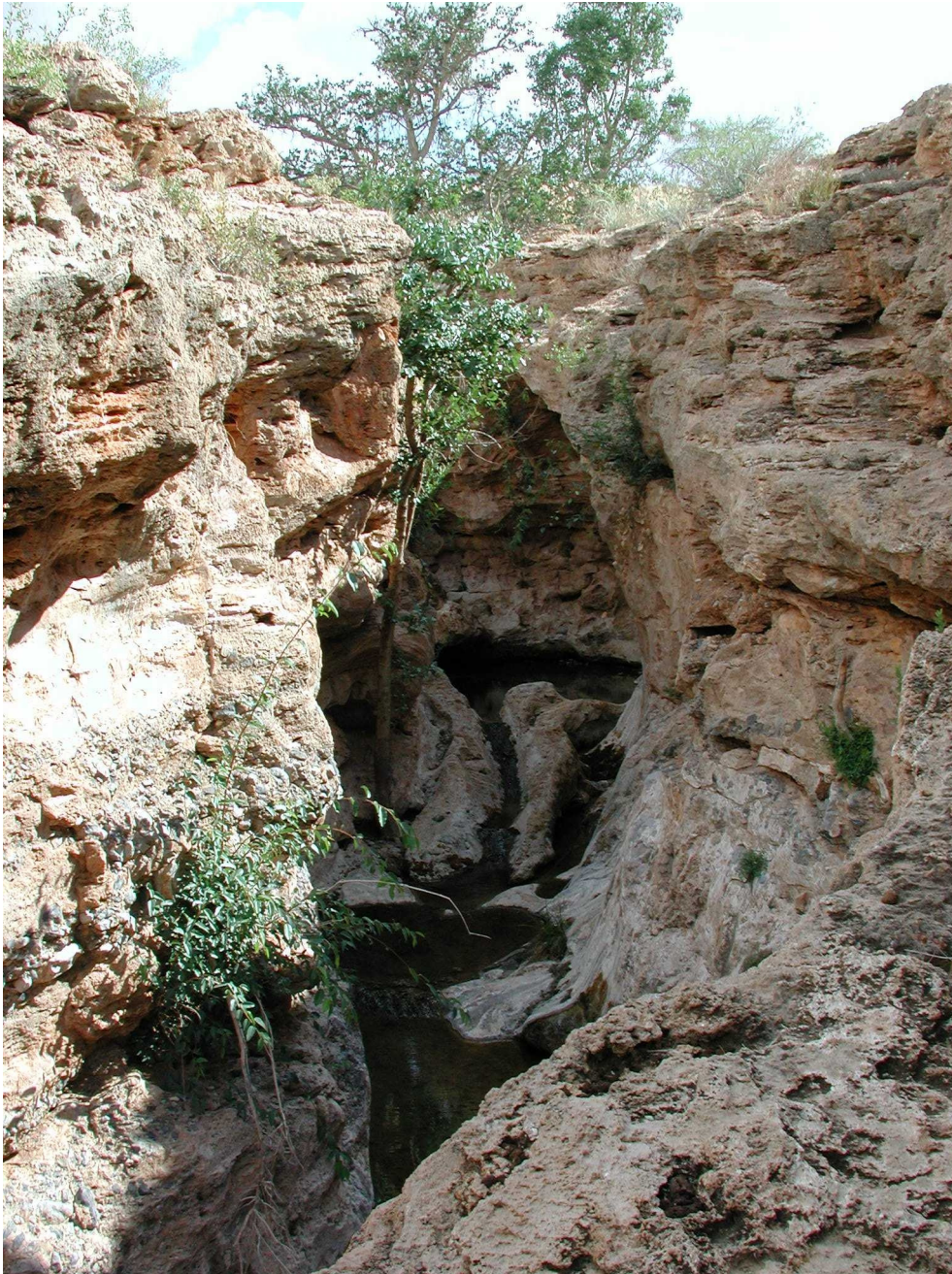
FIGURE 2. Carstic spring stream on Waterkloof Trail in the Naukluft Mountains.

Station 4: RSA, Eastern Cape, Graaff-Reinet District, Asante Sana Game Farm, Waterkloof, east side first order tributary, S 32°15.448', E 24°57.480', 1516 m, 05.iv. 2011, 25.i.2012, 11.xi.2012, leg. W. Mey.