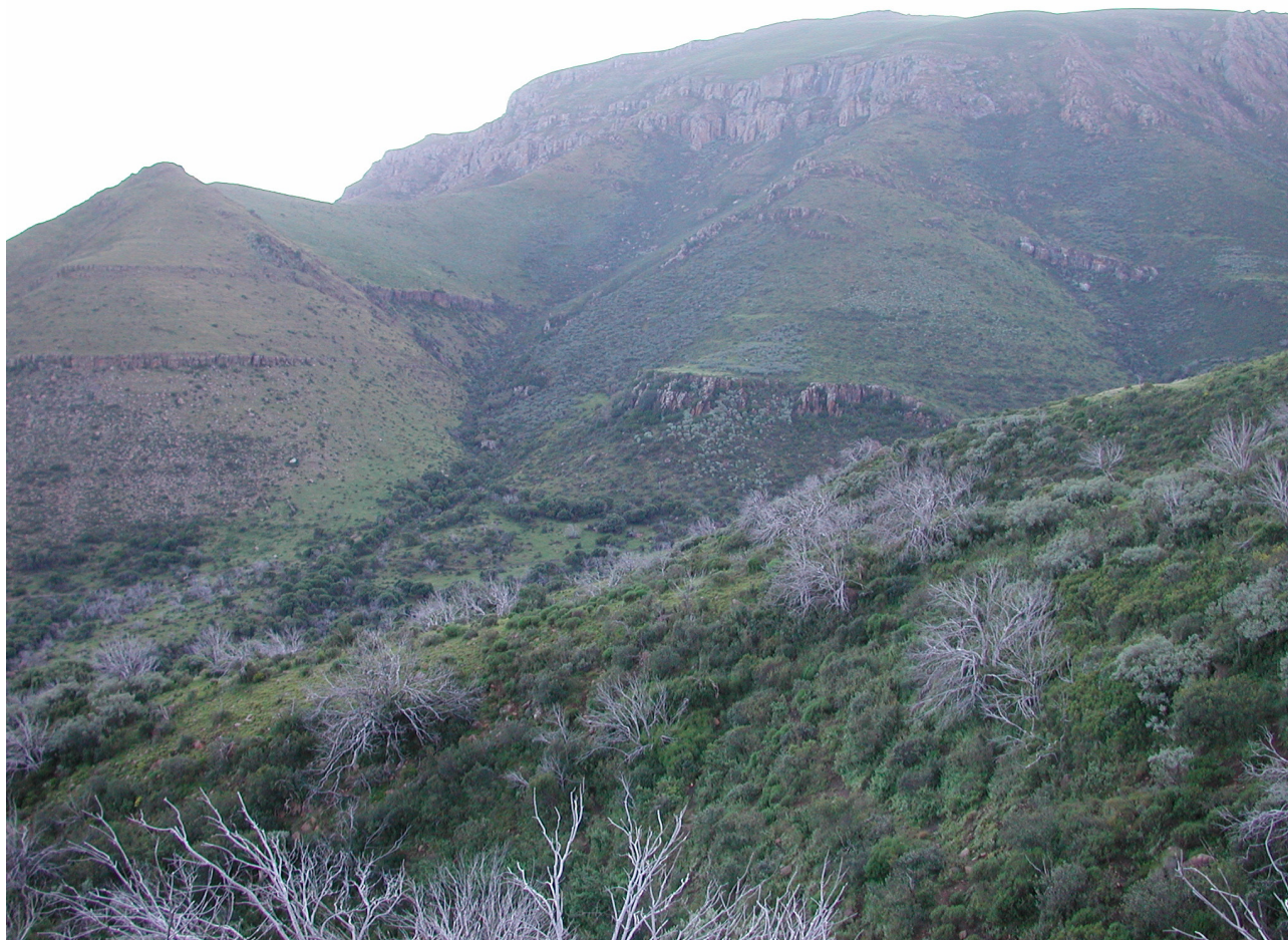
FIGURE 6. Origin of springs and spring streams at the base of the cliffs in the Waterkloof valley.

stability of the fluvial systems in the escarpment. But how far back in time does this presumed permanence go? Evidence for a long history might be the presence of stoneflies (Plecoptera) (Erman 1998). Up to now, not a single representative of this aquatic insect order was collected on Asante Sana or in the Namibian escarpment. Years of drought could have caused extinction. The group is known to have weak dispersal abilities, making recolonisation difficult and demanding time spans that are probably more extensive than necessary for Trichoptera, Odonata or Ephemeroptera. Further collecting in the Great Escarpment should be performed to search for Plecoptera and other Trichoptera species in order to gather additional evidence for providing more detailed explanations on the origin and composition of the spring fauna in these arid and semiarid regions.