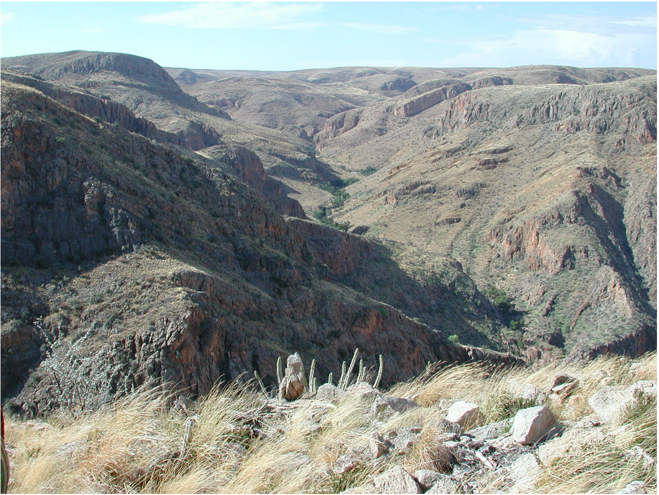
FIGURE 3. View from top of Naukluft Mountains to the narrow stream valley meandering through the mountains.