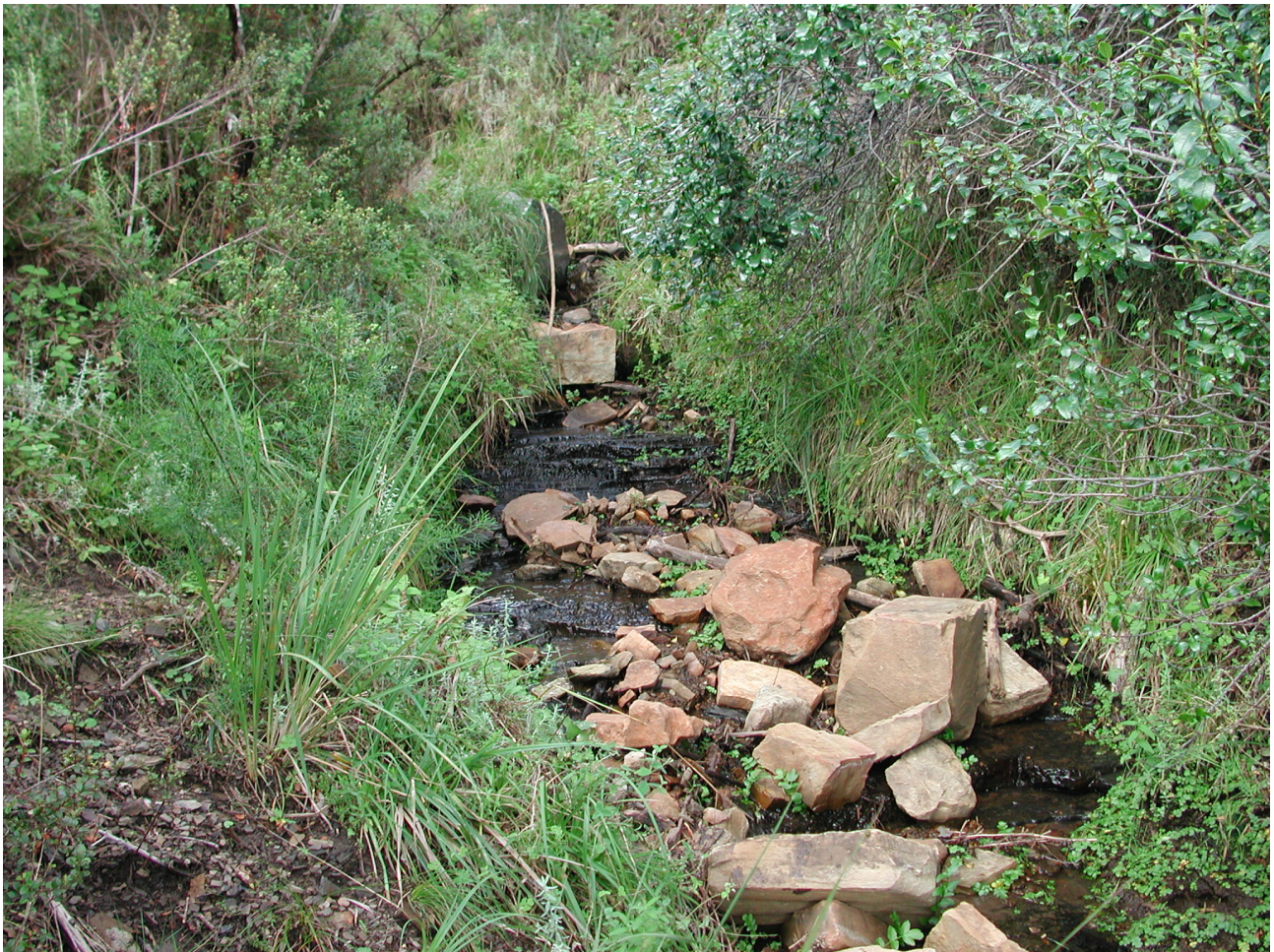
FIGURE 5. Spring stream in the Waterkloof valley.