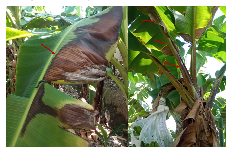
FIGURE 1. Damage associated with by P. musae according to growers.

& Wrensch, 1978; Tien et al. , 2011; Vacante, 2015). Males of P. musae slide their opisthosoma under the sides of the targeted female, as if trying to copulate with quiescent deutonymphs or active females. This behavior, i.e. incomplete sex dissociation, is unusual in eriophyid mites, in which the most commonly observed is the complete sex dissociation (also called mate dissociation or non-pairing, in which sperm transfer via spermatophores occurs in total isolation from both conspecifics) (Michalska et al. , 2010). Interesting contact between male and female was reported once in other species of Phyllocoptruta , the citrus rust mite P. oleivora (Ashmead, 1879). Incomplete sex dissociation has been observed in some water mites, in which spermatophore deposition is triggered only by previous contact with females (Proctor, 1992). Very little is known about the banana rust mite biology, especially in relation to its internal reproductive system, sperm transfer.