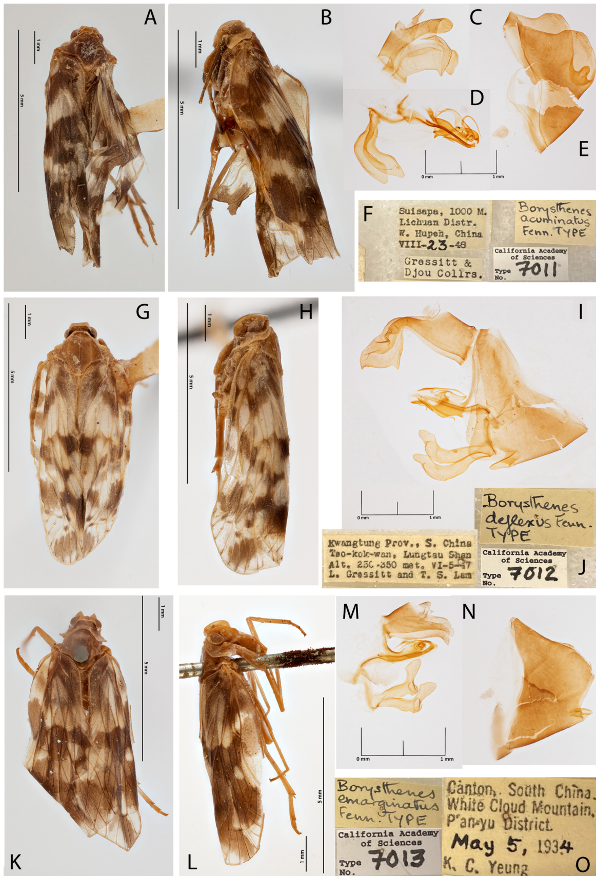
FIGURE 5. Type specimens of Borysthenes species (CAS): A–F, B. acuminatus Fennah (A) dorsal, (B) left lateral; male genitalia (C) anal segment, (D) aedeagus and gonostyli, (E) pygofer; (F) labels. G–J, B. deflexus Fennah (G) dorsal, (H) left lateral; (I) male genitalia; (J) labels. K–O, B. emarginatus Fennah (K) dorsal, (L) right lateral; M–N, male genitalia (M) anal segment, aedeagus and gonostyli, (N) pygofer; (O) labels.