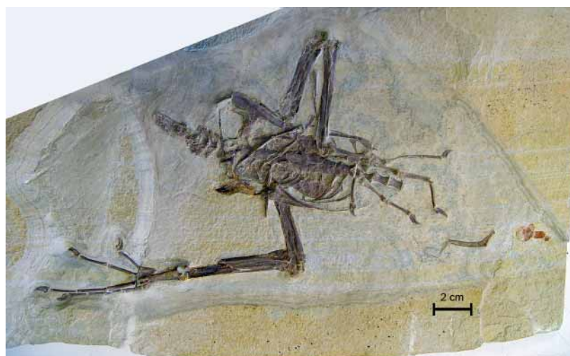
FIGURE 2. Limnofregata azygosternon , referred posterior portion of skeleton FMNH PA 723.