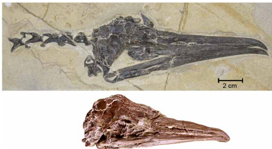
FIGURE 5. Limnofregata hasegawai , new species, holotype GMNH PV 170 (above), compared with skull and mandible of the holotype of L. azygosternon USNM 22753 (below).

Diagnosis: Much larger than L. azygosternon . Rostrum proportionately much longer, 1.6 times as long as the cranium, vs. 1.4 in L. azygosternon .