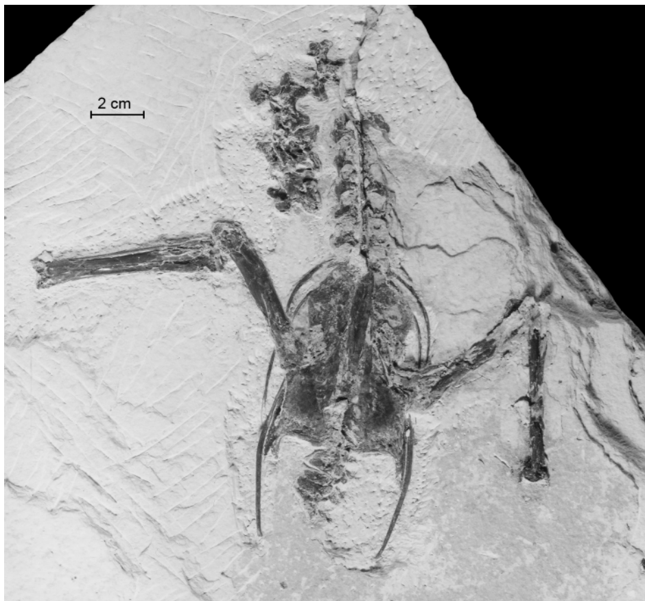
FIGURE 7. Limnofregata hasegawai , paratype, BMS E 25336 associated pelvis and hindlimbs without feet.

Paratype 2: BMS E25336, pelvis with associated right and left femora and tibiotarsi, the first 5 free caudal vertebrae, and 10 presacral vertebrae (Fig. 7). Collected by Verl and Rick Hebdon and acquired by the Buffalo Museum of Science in 1982.