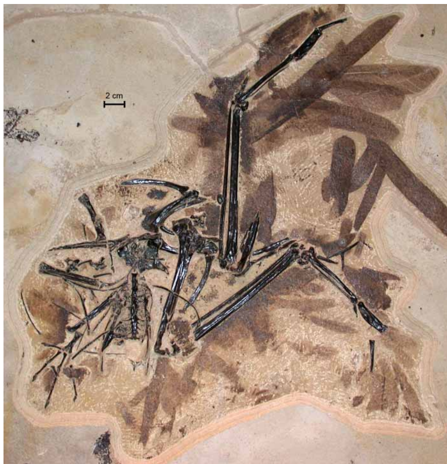
FIGURE 1. Limnofregata azygosternon , referred postcranial skeleton with feather impressions GMNH PV 167.