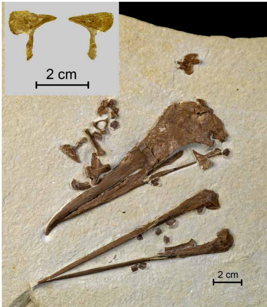
FIGURE 6. Limnofregata hasegawai , new species, paratype, FMNH PA 719, skull and mandible. Scale = 2 cm. Inset: right and left lacrimal bones showing pneumatic foramina in the corpus.