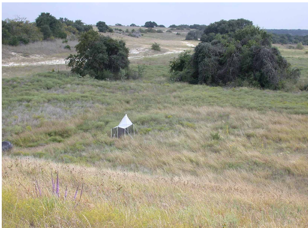
FIGURE 1. Malaise trap at type locality for Halictophagus forthoodiensis Kathirithamby & Taylor, at Fort Hood, Coryell County, Texas.

des) with scattered plateau live oak ( Quercus fusiformis ) mottes; drainage from a sediment control pond outlet, just upslope of the malaise trap, was dominated by sedge ( Carex spp.) and short ragweed ( Ambrosia artemisiifolia ).