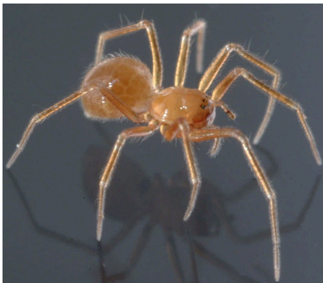
FIGURE 12. Savignia naniplopi sp. nov., female paratype. 12, habitus photograph of living specimen.

of subterranean cracks and fissures which constitute a special biotope, accomodating a number of endemic troglophilous life forms with restricted distributions.