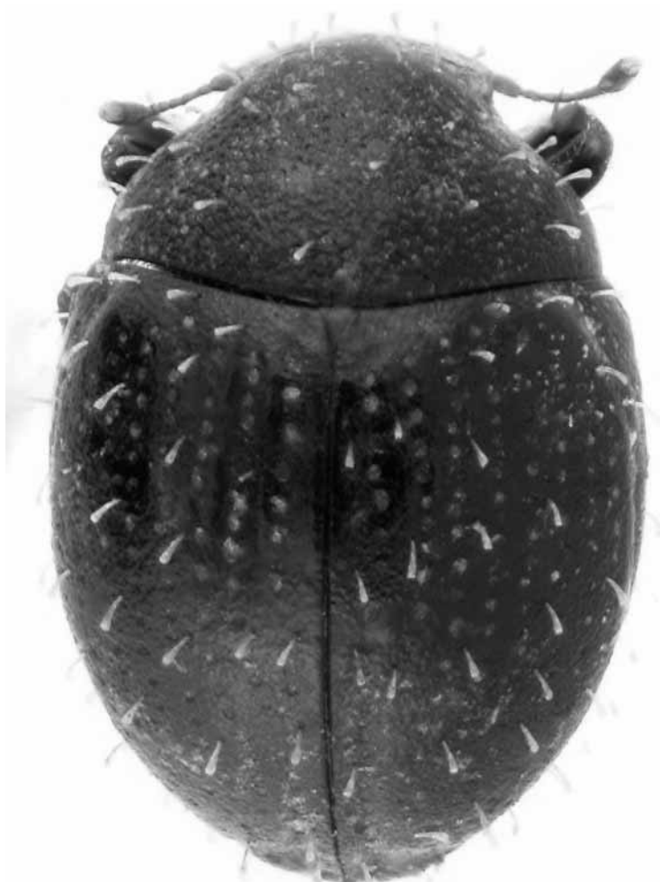
FIGURE 1. Chaetophora spinosa . Dorsal habitus. Note the clavate bristles.

On 27 June 2003, six specimens of Chaetophora spinosa were collected along the Princeton-Wharburton Rd. in St. Patricks, Queens County, PEI (CGMC) (Figures 1–2). The beetles were found in wet mud adjacent to roadside puddles along an unpaved road, a short distance from agricultural fields. Three additional specimens were collected by C. Majka on 15 August 2004 at Millvale, PEI, (~ 2 kilometers from the previous site) also in wet mud adjacent to a small mill-pond (CGMC). Additional specimens were seen at both sites. On 26 July 2005 a quadrant at the edge of a field planted with timothy ( Phleum pratense L.), an introduced European grass, in Woodville Mills, Kings County, PEI was investigated. Seventeen specimens of C. spinosa were collected (CGMC) at a density of 10/m 2 . Individuals were found on bare mud and associated with the moss Mnium hornum Hedw.