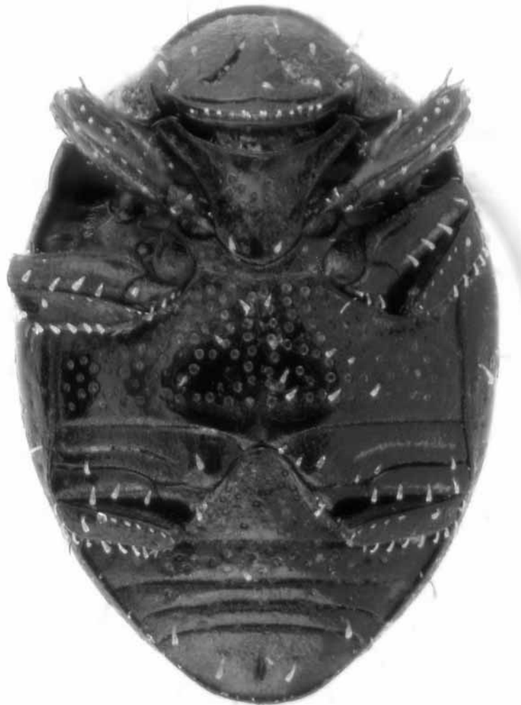
FIGURE 2. Chaetophora spinosa . Ventral habitus. Note the appendages, retractile into deep recesses and flush with the sterna when withdrawn. When contracted the anterior margin of the clypeus meets the anterior margin of the prosternum, hiding the withdrawn eyes, antennae, and mouthparts.

In 2004-05 (14 June, 28 June, 12 July, 26 July, and 9 August, 2004; 30 May 2005), C. Noronha and M. Smith collected 42 specimens of C. spinosa in pitfall traps set in barley and soybean fields in Harrington, Queens County, PEI (ACPE). Collection locations are indicated in Figure 3 . Three specimens of Simplocaria semistriata (Fabricius) were also collected on 28 June and 16 September, 2004. The specimens of C. spinosa represent the first records of this species from Atlantic Canada while S. semistriata is newly recorded from Prince Edward Island.