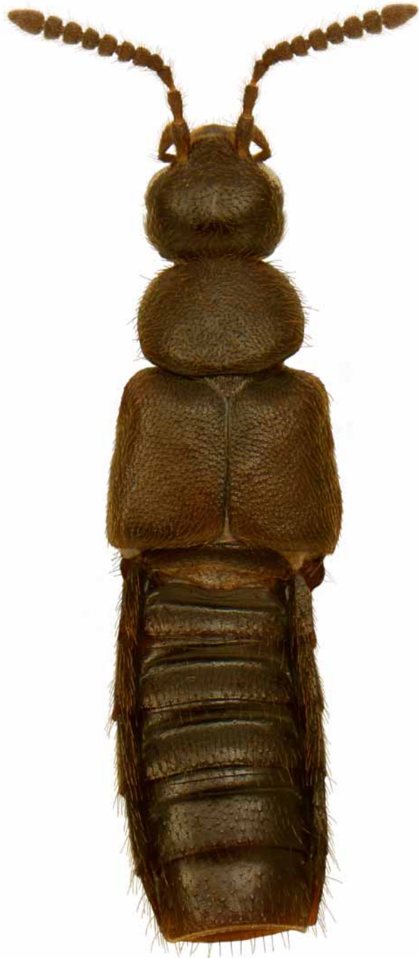
FIGURE 6. Habitus photograph of Atheta irrita Casey.

two different host species at sites that are circa 130 kilometers apart, on both the mainland and Cape Breton Island, also suggesting that this species may be widely distributed in Nova Scotia in suitable habitats.