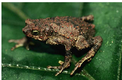
FIGURE 1. Adult female holotype of Chaunus tacana sp. nov. from Serranía Eslabón, Madidi National Park, Bolivia (MNK-A 7188)

form of the stripes. Some individuals have more red warts. SVL of two juveniles: 25.3 (MNCN 42072, female) and 21.8 (NKA-A7194, unsexed). NKA-A 7187 lack dorsal pattern and is darker than any other specimen in alcohol (Fig. 3).