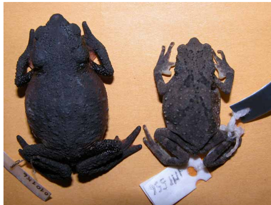
FIGURE 4. Dorsal view of an adult female of Chaunus sp. (left) from Department Cusco, Peru and the holotype (adult female) of Chaunus tacana sp. nov. (MNK-A 7188).