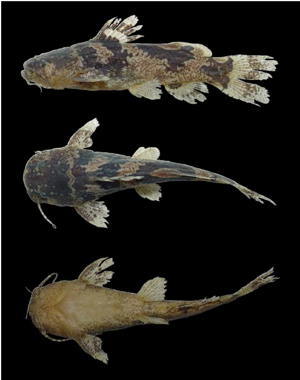
FIGURE 1. Microglanis leptostriatus , MZUSP 85985, holotype, 42.28 mm SL. Rio Verde Grande, rio São Francisco basin, Montes Claros, Minas Gerais, Brazil.

lower lobes. Anal fin with dark blotch on bases of third, fourth, fifth, sixth and seventh rays and dark brown crescentic band on middle portions of rays and membranes. Dark stripe in the axis of gill filaments.