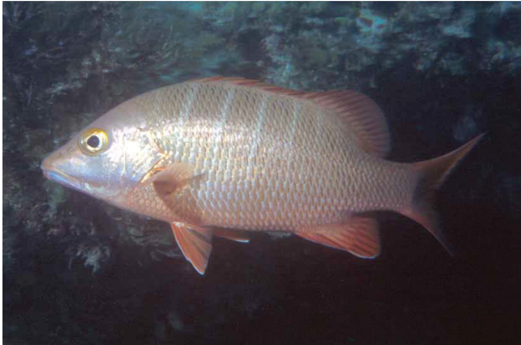
FIGURE 2. Underwater photograph of Lutjanus alexandrei . Parcel das Paredes (17°53'54"S, 38°57'13"W), Abrolhos Bank, Bahia, Brazil (R.L. Moura).