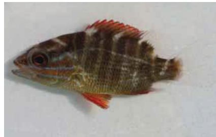
FIGURE 3. Early juvenile individual of Lutjanus alexandrei , 27 mm SL, collected in the mouth of Rio Mamucabas, Tamandaré (08°49'S, 035°05'W), State of Pernambuco, Brazil, 1 m depth (Beatrice P. Ferreira & Sérgio Resende, 18 February 2005).

Distribution, ecology and behavior. The Brazilian snapper, L. alexandrei is only recorded from the tropical portion of the southwestern Atlantic continental shelf, and has a narrower latitudinal range than other Western Atlantic species of Lutjanus . It is known from the state of Maranhão (00°52'S) to the southern coast of the state of Bahia (18°0'S), Brazil, in areas under the influence of the west-flowing Equatorial Current (northern Brazil) and the south-flowing Brazil Current (northeastern Brazil). It is apparently absent from oceanic islands. Additional collections may show an even broader distributional range for this species, as was the case with 48 other poorly known reef-fish species in the southwestern Atlantic (Moura et al. 1999).