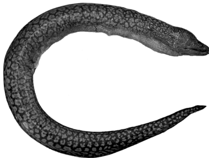
FIGURE 3. Gymnothorax baranesi , paratype, 762 mm, HUI 18975.

Sex and sexual dimorphism. The holotype is a male, with recognizable but not greatly enlarged testes. The HUI paratype has been gutted, and nothing remains of the viscera. The USNM paratype, intermediate in size, is immature, and its sex cannot be determined. It appears, then, that Gymnothorax baranesi matures at a relatively large size, larger than the specimens described here. Sexual dimorphism has been reported in the dentition of several moray eels (Collette, et al., 1991: 347). Adult males have larger and fewer maxillary and mandibular teeth than females and immatures, and the inner maxillary teeth are lost. The evidence indicates that Gymnothorax baranesi follows this pattern. In the adult male holotype the inner maxillary teeth are absent and the outer teeth are enlarged and continuous with those of the intermaxillary series. Both paratypes retain the inner maxillary teeth, and the outer maxillary teeth are smaller and more numerous. The holotype has 18 teeth in the combined outer maxillary and peripheral intermaxillary series, whereas the two paratypes have 19–21. The holotype has 17–19 mandibular teeth, whereas the paratypes have 19–24. One of the paratypes is sexually immature, thus conforming to the pattern of having more and smaller teeth than the adult male. The other paratype is indeterminate, but its dentition indicates that it is either a female or an immature male.