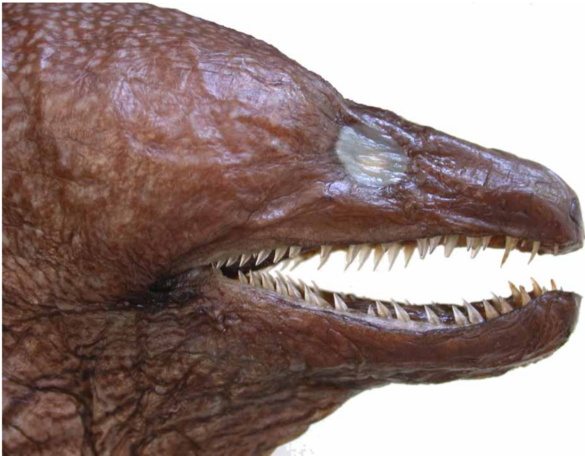
FIGURE 2. Head of holotype.

between anterior nostril and eye, and one just anterior to a vertical through posterior margin of eye; two pores at anterior end of lateral-line canal, anterodorsal to gill opening.