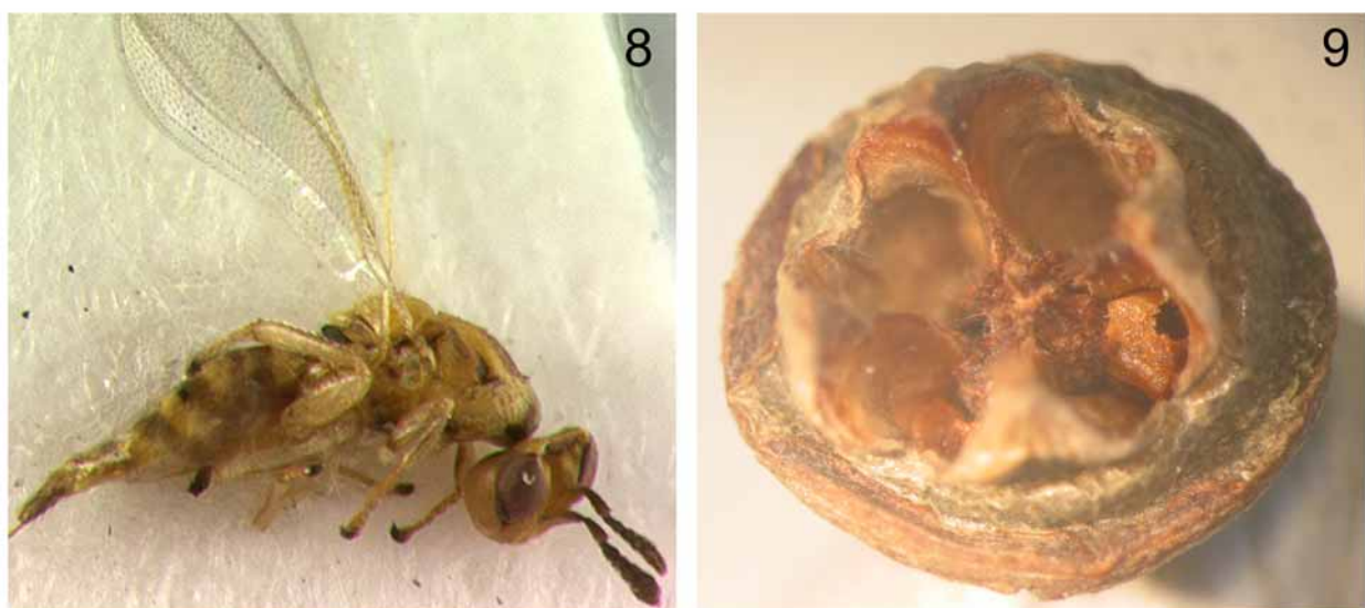
FIGURES 8–9. Leprosa milga and galled seeds of Eucalyptus ?camaldulensis . 8. L. milga ♀; 9. seeds with emergence hole in a seed capsule.

Type material. Holotype ♀: SOUTH AFRICA WCAPE, Stellenbosch, 33.56S, 18.51E, 30.ix.2004, S. Nesar. ex. galls in locules of ripe seed capsules of Eucalyptus ?camaldulensis . (ANIC) .