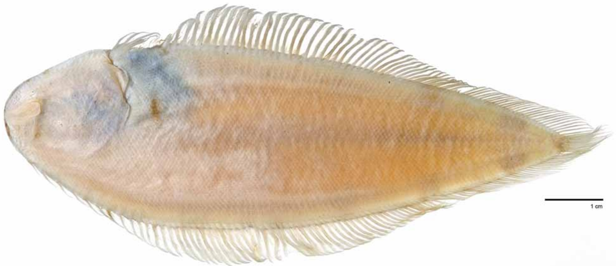
FIGURE 2. Blind-side view of holotype of Symphurus thermophilus , new species, holotype NSMT-P 70849, 98.7 mm SL, adult female collected at Kaikata Seamount, Minami-Ensei Knoll, Mid-Okinawa Trough, Western Pacific.

Description. A diminutive species attaining maximum sizes of about 102 mm SL. Summaries of meristic data appear in Table 1 (see also Remarks section below). ID pattern 1–2–2–2–2 (15/16), rarely 1–2–2–1–2. Caudal-fin rays 14. Dorsal-fin rays 88–94. Anal-fin rays 74–80. Pelvic-fin rays 4. Total vertebrae 47–51 (usually 48–50); 9(3 + 6) abdominal vertebrae (15/16 individuals), rarely 10(3 + 7; one individual). Hypurals usually 5 (one specimen each with 4 or 6 hypurals). Longitudinal scale rows 100–112. Scale rows on head posterior to lower orbit 20–24. Transverse scales 47–56.