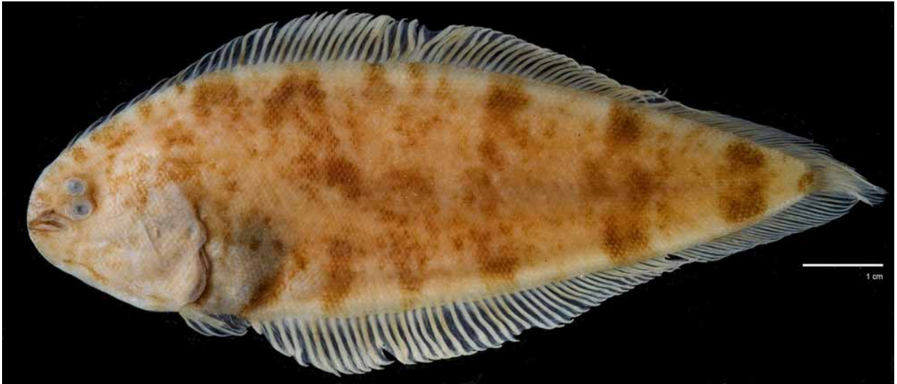
FIGURE 1. Ocular-side view of Symphurus thermophilus , new species, holotype NSMT-P 70849, 98.7 mm SL, adult female, collected at 440 m on Kaikata Seamount, Minami-Ensei Knoll, Mid-Okinawa Trough, Western Pacific, 17 August 1996.

Diagnosis. Symphurus thermophilus is distinguished from congeners by the combination of: a 1–2–2–2–2 ID pattern, 14 caudal-fin rays, 9 abdominal vertebrae, 47–51 total vertebrae, 5 hypurals, 88–94 dorsal-fin rays, 74–80 anal-fin rays, 47–56 scales in a transverse series, 100–112 scales in a longitudinal series, black peritoneum, medium to dark brown ocular-surface background pigmentation with distinct pattern of darker blotches and complete and incomplete crossbands, and a uniformly whitish blind side.