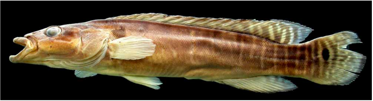
FIGURE 1. Crenicichla zebrina . Holotype MCNG 45975, 189.0 mm SL; Venezuela: Amazonas, Orinoco River drainage, lower Ventuari River in front of Cucurital fishing camp.