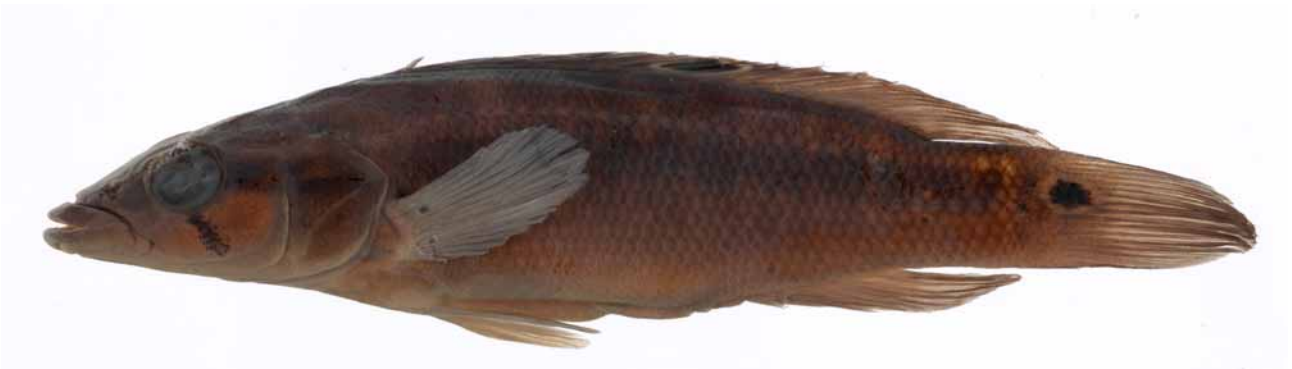
FIGURE 1. Crenicichla mandelburgeri , holotype, adult female, 82.5 mm SL, MHNG 2691.043. Paraguay, Itapúa, Arroyo Tembey above falls.

serrated, and black dots marking lateral line scales absent vs. present. Distinguished from C. yaha and C. iguassuensis from the Urugua-í and Iguazú basins respectively, by dark lateral band along the side vs. a row of dark blotches along the middle of the side. Distinguished from coastal species C. maculata , C. punctata , C. lacustris , C. tingui , and C. iguapina by larger scales in the E1 row, 44–56 vs. 56–75.