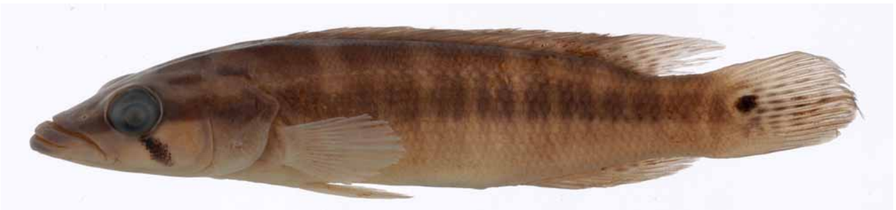
FIGURE 3. Crenicichla mandelburgeri , paratype, adult male, 78.6 mm SL, NRM 42898. Paraguay, Itapúa, Arroyo Pirapó.

Description. Largest male 114.6 mm SL, largest female 82.5 mm SL. Refer to Figures 1–5 for general aspect. Head about as wide as deep. Caudal peduncle slightly longer than deep. Snout moderately long, rounded from above, bluntly pointed in lateral view. Lower jaw slightly prognathous, its articulation below middle of orbit; ascending premaxillary processes reaching to 1/4 of orbit; maxilla reaching to or slightly surpassing vertical from anterior margin of orbit. Lips thick and wide, lower lip folds separate anteriorly; folds of upper lip not continuous but cutting into a symphyseal wide thickening. Postlabial skin fold margin truncate. Orbit supralateral, not visible from below, chiefly in anterior half of head. Interorbital area flat, narrower than mouth. Nostril dorsolateral, about halfway between orbit and margin of postlabial skin fold,