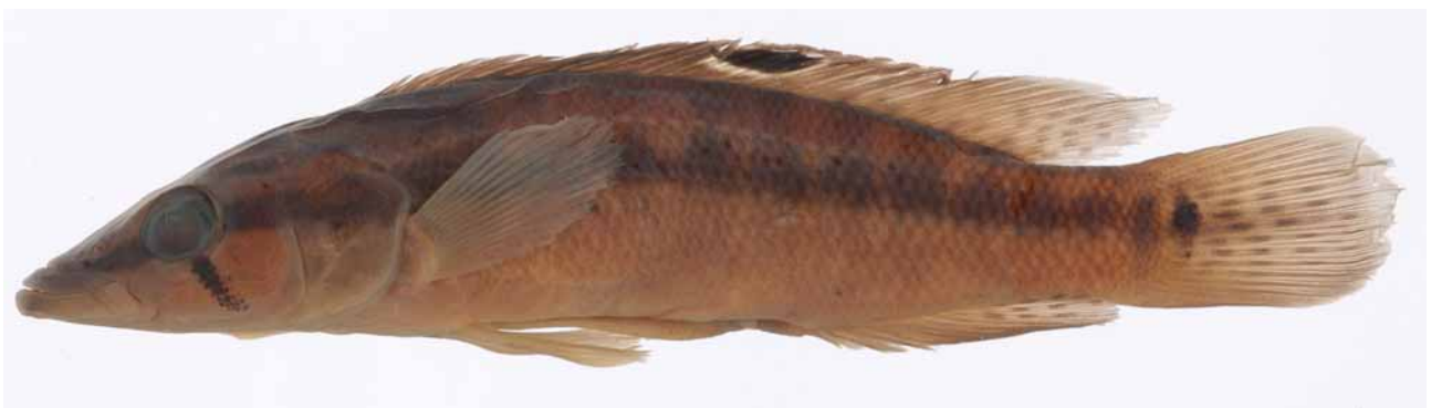
FIGURE 5. Crenicichla mandelburgeri , paratype, adult female, 88.9 mm SL, MHNG 2691.047. Paraguay, Itapúa, Arroyo Poromoco.

Lateral-line scales in Tembey specimens 24/10 (3), 25/10 (3), 25/11 (3), 26/9 (1); in Poromoco specimens 23/12 (2), 23/13 (1), 24/10 (1), 24/11 (2), 25/10 (1), 25/11 (2), 25/12 (1); 2 scales continuing lower line onto caudal fin; one tubed accessory lateral-line scale on caudal fin, between rays D3 and D4, in one specimen. Upper and lower lateral lines overlapping by one scale. Scales between upper lateral line and dorsal fin 11 anteriorly, 3½ posteriorly; scale rows between lateral lines 2. Anterior upper lateral-line scales larger and more elongate than adjacent scales, remaining lateral-line scales nearly same size as adjacent scales; three scales impinging on each scale of anterior part, two on each scale of posterior part of upper lateral line; 1–2 scales impinging on each scale of lower lateral line. Dorsal, anal, pectoral and pelvic fins without scales. Caudal-fin squamation extending to about 1/3 of fin, posterior margin of scaled area straight vertical.