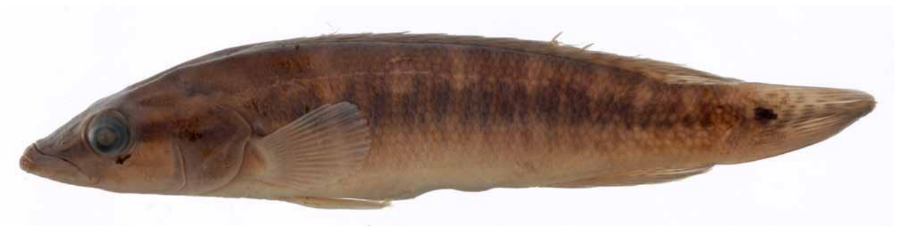
FIGURE 2. Crenicichla mandelburgeri , paratype, adult male, 98.2 mm SL, NRM 42475. Paraguay, Itapúa, Arroyo Guazúy.