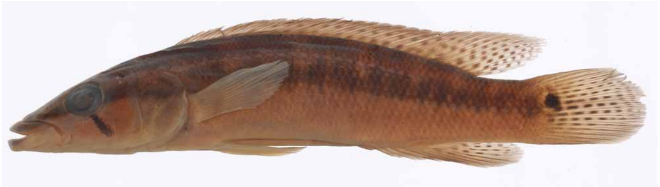
FIGURE 4. Crenicichla mandelburgeri , paratype, adult male, 88.5 mm SL, MHNG 2691.047. Paraguay, Itapúa, Arroyo Poromoco.

Flank scales strongly ctenoid. All scales cycloid on head, on dorsum above anterior 1/3 of upper lateral line, along dorsal-fin base, on chest, and on belly below line from lower edge of pectoral-fin base to anal-fin origin. Predorsal scales small, embedded in skin, extending forward to transverse frontal lateralis canal. Prepelvic scales very small, deeply embedded in skin. Cheek naked anteroventrally; below eye 5–7 scales, embedded in skin. Interopercle naked. Scales in E1 row in Tembey specimens 44 (1), 46 (2), 47 (4), 48 (2), 50 (7), 51 (3), 54 (1), 55 (1); in Poromoco specimens 48 (1), 50 (1), 51 (1), 52 (3), 53 (2), 55 (1), 56 (1). Transverse scale row 14–15+1+5. Circumpeduncular scale rows 10–11 dorsally, 11–12 ventrally (23–24 including lateral lines).