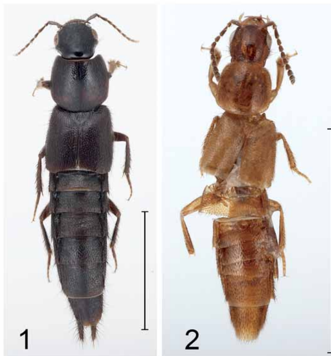
FIGURES 1–2. Australotarsius grandis (1) and A. tasmanicus (2), habitus. Scale bar 5 mm.

Etymology. The genus name is derived from two words “Australia” and “tarsus”. It refers to the country of origin and spectacular wide anterior tarsi of this new taxon. It is Latinized noun of masculine gender.