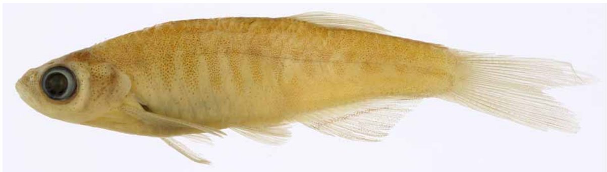
FIGURE 2. Danio aesculapii , holotype, NRM 44490, male, 22.5 mm SL; Myanmar: Rakhine State: Thandwe: Kananmae Chaung, near Leldee village.