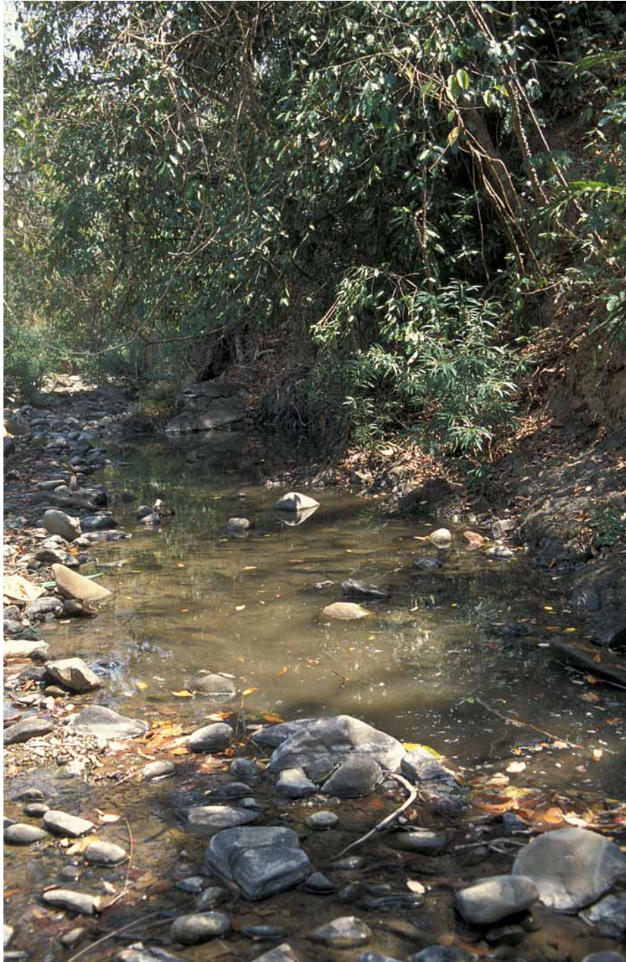
FIGURE 4. Danio aesculapii . Type locality. Myanmar: Rakhine State: Thandwe: Kananmae Chaung, near Leldee village. 20 March 1998.