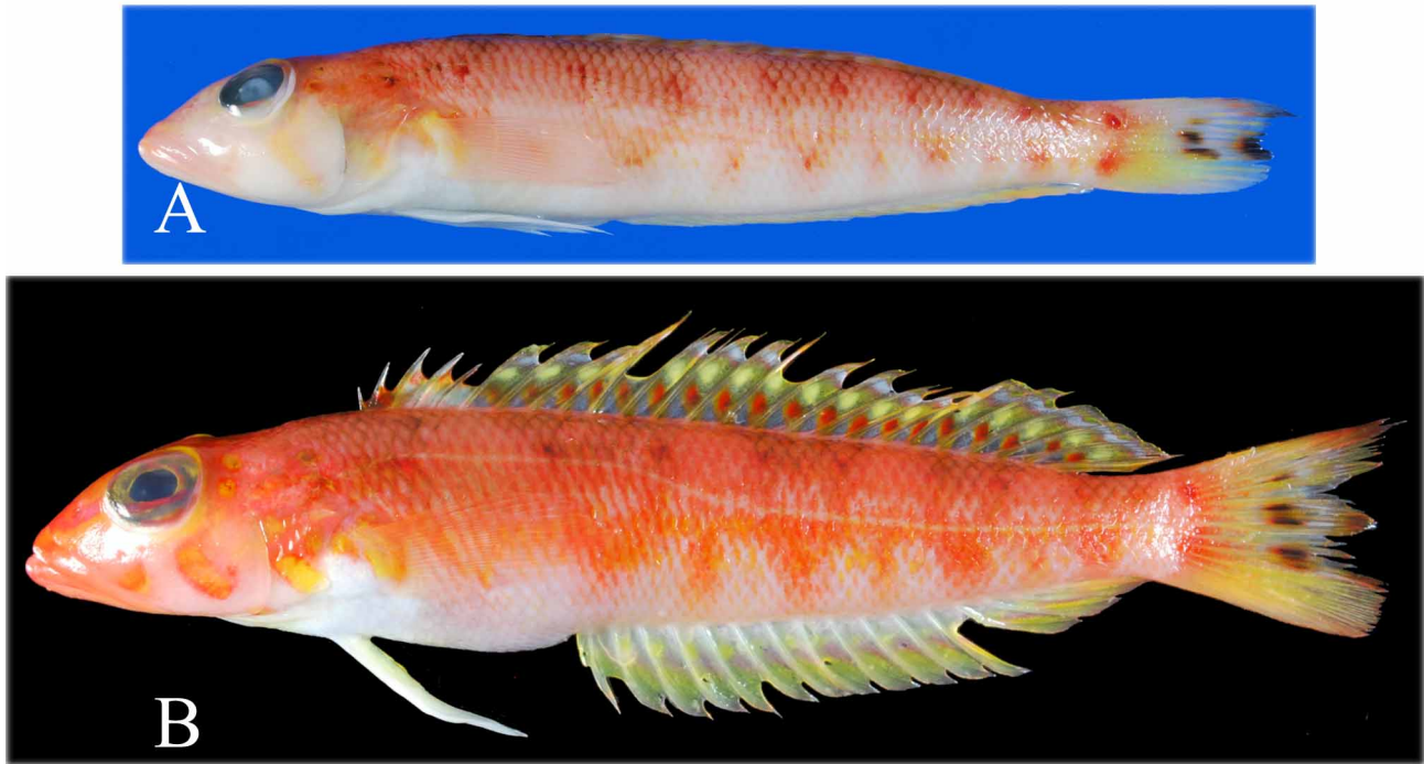
FIGURE 2. Parapercis randalli sp. nov., A. NMMBP 10463, paratype, 1 of 2 specimens, female, 102.2 mm SL, after 2 days preservation in formalin. B. QM I.38817, paratype, 96.9 mm SL, fresh caught specimen.

Origin of dorsal fin over 3rd lateral-line scales (2nd or 3rd in all paratypes), the predorsal length 3.2 (3.2–3.4) in SL, equal to head length; 1st dorsal spine 13.8 (7.4–15.7) in HL; 2nd dorsal spine 6.6 (4.7–6.6) in HL; 3rd dorsal spine 5.7 (4.2–5.7) in HL; 4th dorsal spine longest, 4.5 (3.5–4.5) in HL; 5th dorsal spine 4.7 (4.3–4.9) in HL, entirely attached to 1st soft ray by membrane; last dorsal soft ray longest, 2.3 (1.9–2.4) in HL; origin of anal fin below base of 4th dorsal soft ray, the preanal length 2.2 (2.1–2.2) in SL; anal spine 8.0 (6.5–8.8) in HL; last anal soft ray longest, 2.5 (2.3–2.5) in HL; posterior margin of caudal fin slightly rounded on ventral half, a small notch at middle, truncate on dorsal half, with a prolonged upper lobe centered on 3rd branched ray, extending about 2/3 orbit diameter posterior to central margin of fin, the total fin length 4.6 (4.5–4.9) in SL, 1.4 in HL; pectoral fins broadly rounded when spread, the tenth ray longest, 5.1 (4.8–5.1) in SL, 1.6 (1.4–1.6) in HL; origin of pelvic fins anterior to that of pectoral fin, below base of exposed part of opercular spine, the prepelvic length 3.7 (3.6–3.8) in SL, 1.1 (1.1–1.2) in HL; pelvic spine slender, 4.7 (4.3–4.7) in HL; pelvic fins extends beyond the anus (slightly beyond in 96.9-mm paratype), the fourth soft pelvic ray longest, 5.1 (5.0–5.6) in SL, 1.6 (1.4–1.6) in HL.