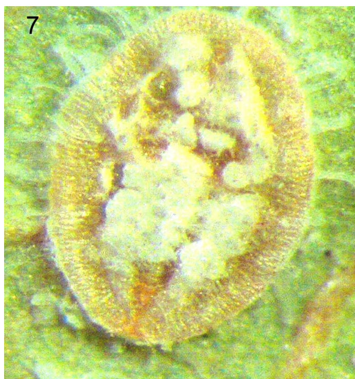
FIGURE 7. Bemisia flocculosa . Puparium with dorsal wax.

Paratypes will be distributed to: California Department of Food and Agriculture, Sacramento California, U.S. National Museum, Beltsville, Maryland, The Natural History Museum, London, and New Zealand Arthropod Collection, Landcare Research, Auckland, New Zealand.