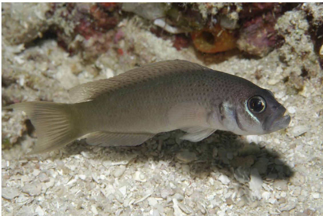
FIGURE 1. Pseudochromis erdmanni new species, female individual, ca. 60 mm SL, Pulau Taunalu, Loloda Selatan, Halmahera, North Maluku Province, Indonesia.

Description (based on eight specimens, 48.7–81.5 mm; data for all types followed, where variation was noted, by data for holotype in parentheses): Dorsal-fin rays III,25–27 (III,26), all or all but first (all) segmented rays branched; anal-fin rays III,13–14 (III,14), all segmented rays branched; pectoral-fin rays 17–19 (18/18); upper procurrent caudal-fin rays 6; lower procurrent caudal-fin rays 5–6 (5); total caudal-fin rays 27–28 (28); scales in lateral series 40–45 (43/43); anterior lateral-line scales 33–36 (35/35); anterior lateral line terminating beneath segmented dorsal-fin ray 19–21 (20/20); posterior lateral-line scales 5–9 + 0–2 (9 + 0/9 + 1); scales between lateral lines 3–4 (4/4); horizontal scale rows above anal-fin origin 13–16 + 1 + 3–4 = 17–20 (15 + 1 + 3/14 + 1 + 3); circumpeduncular scales 20; predorsal scales 17–21 (17); scales behind eye 3–4 (4); scales to preopercular angle 6–8 (8); gill rakers 5–6 + 11–12 = 16–18 (5 + 12); pseudobranch filaments 13–16 (15); circumorbital pores 26–35 (35/32); preopercular pores 12–14 (14/14); dentary pores 4; posterior interorbital pores 1–2 (1).