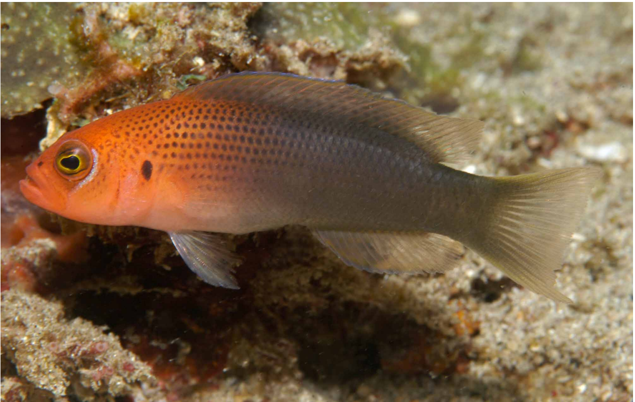
FIGURE 2. Pseudochromis erdmanni new species, male holotype, NCIP 6344, 81.5 mm SL, Pulau Taunalu, Loloda Selatan, Halmahera, North Maluku Province, Indonesia.

Lower lip varying from incomplete with weak symphyseal interruption to complete; dorsal and anal fins without scale sheaths, although sometimes with intermittent scales overlapping fin bases; predorsal scales extending anteriorly to point ranging from posterior AIO to mid AIO pores; opercle with 4–6 large, distinct serrations, sometimes with additional small serration below subopercle junction; teeth of outer ceratobranchial-1 gill rakers varying from well developed on distal tips of rakers only, to well-developed along most of raker lengths; anterior dorsal-fin pterygiophore formula S/S/S + 3/1 + 1/1/1 + 1*/1 (S/S/S + 3/1 + 1/1/1 + 1/1); dorsal-fin spines stout and pungent; anterior anal-fin pterygiophore formula 3/1 + 1*/1/1/1 + 1 (3/1 + 1/1/1/1 + 1); anal-fin spines stout and pungent, second spine stouter than third; pelvic-fin spine stout and pungent; second segmented pelvic-fin ray longest; caudal fin emarginate to deeply emarginate (almost lunate); vertebrae 10 + 15–16 (10 + 16); epineurals 14–15 (15); epurals 3.