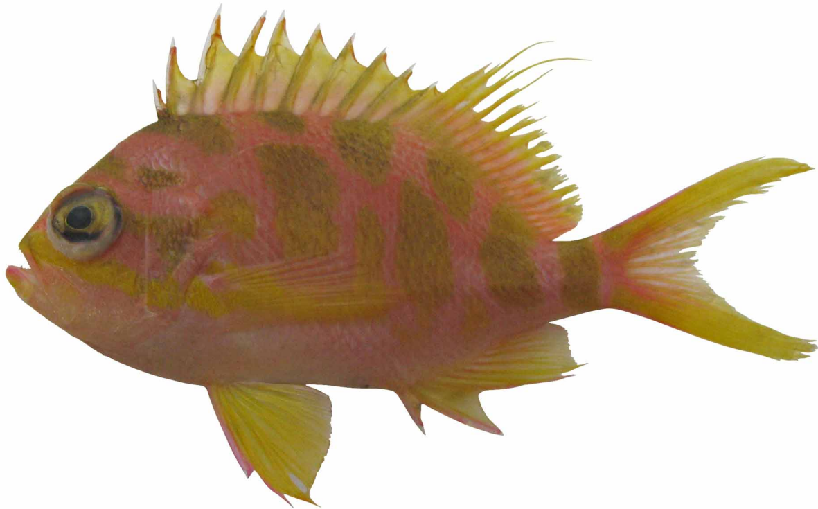
FIGURE 3. Lateral view of Odontanthias borbonius , CSIRO H 7221–02, 92 mm SL, east Lombok, Indonesia.

Distribution. Currently known only from East Lombok in the Nusa Tenggara region of Indonesia. All type specimens were collected from the fish market at Tanjung Luar from handline fishers operating in local waters.