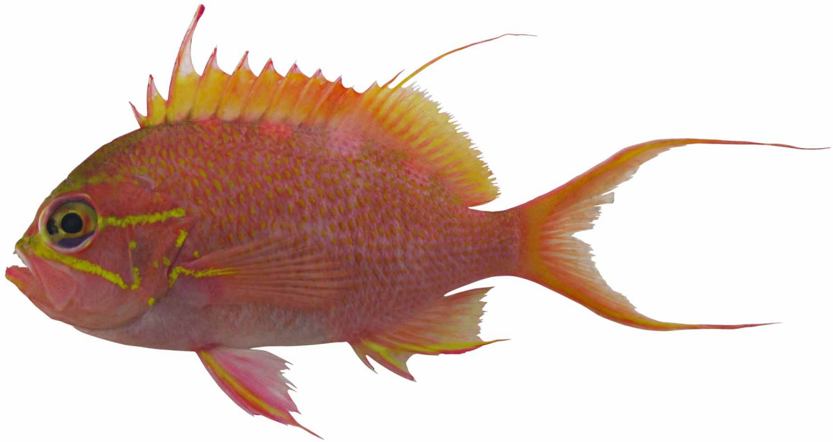
FIGURE 1. Lateral view of Odontanthias randalli n. sp., holotype MZB 20010, 121 mm SL, east Lombok, Indonesia.

low stripe on anterior third extending from base of fin to about one-third distance of longest rays; pelvic fin mostly pink with yellow pigment on membrane between first and second soft rays.