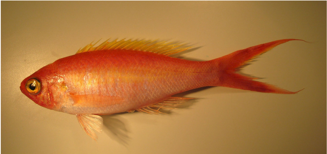
FIGURE 1. Symphysanodon disii (TAU P. 13320, 159 mm SL), Gulf of Aqaba.

The color photograph of the freshly collected holotype in the original description (Khalaf and Krupp, 2008:86, fig. 1) shows the head to be mainly red orange; body to be mostly red orange dorsally above faintly visible yellowish band running from opercle to about middle of caudal peduncle, rose in broad swath ventral to yellowish band; iris mainly orange to red orange with some blackish pigment anterodorsally; dorsal fin yellow, pectoral fin rosy, anal and pelvic fins rosy with transparent membranes, caudal fin mainly rosy overlain by yellowish on ventral border of upper lobe. A color photograph of one of the TAU specimens (Fig. 1; TAU P. 13320, 159 mm SL) shows it to have coloration similar to that of the holotype, differing in the iris being more yellow and the caudal fin almost entirely purplish rose with narrow yellowish borders along inner margins of both lobes.