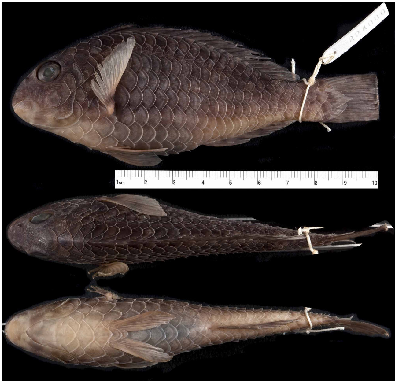
FIGURE 1. Lateral, dorsal and ventral views of the holotype of Sparisoma choati , CAS 224080.

red brown, pectoral fin brownish red with yellowish green base and a black spot on upper fifth of that fin base, ventral fin brownish red anteriorly and greenish blue posteriorly.