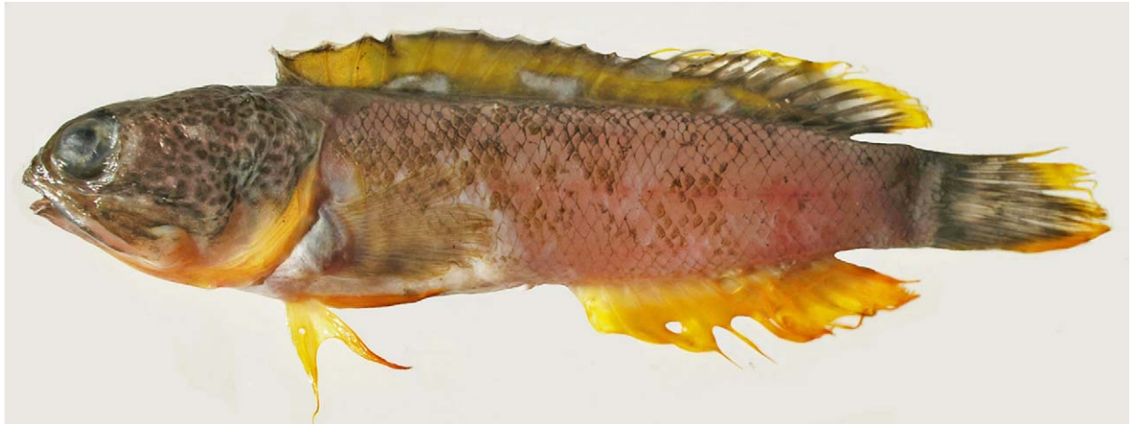
FIGURE 1. Opistognathus pardus , n. sp., CMFRI GB.31.104.1.2, male 98.8 mm SL, off Quilon, Kerala, SW coast of India.

Diagnosis. A species of Opistognathus with the following combination of characters: rigid maxilla without flexible lamina posteriorly; head mostly covered with small, irregular-shaped dark spots (head without such spots except in the Australian species O. darwinensis Macleay 1878); dorsal fin XI, 11; total gill rakers 40–41; outermost segmented pelvic-fin ray tightly bound to adjacent ray, with interradiial membrane not incised distally (interradiial membrane deeply incised in all other Indo-Pacific species except O. muscatensis Boulenger 1887).