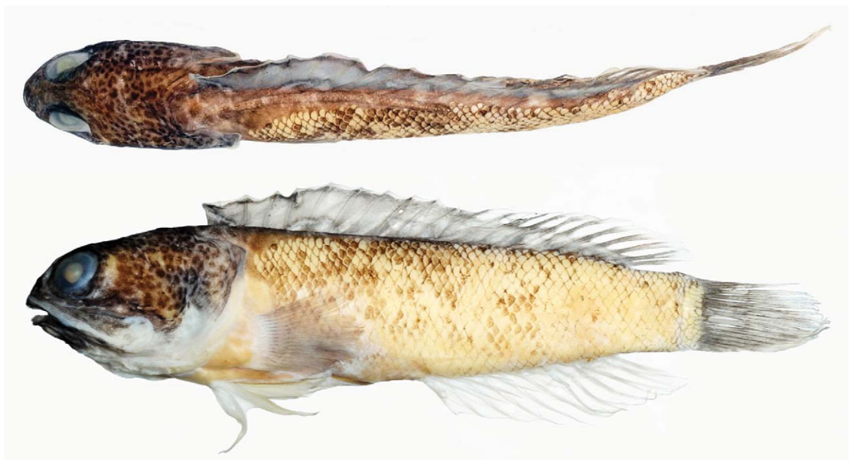
FIGURE 2. Opistognathus pardus , holotype (preserved in alcohol).

Description. (When bilateral counts vary, those from the right side are given in parentheses). Dorsal-fin rays XI, 11. Anal-fin rays II, 11. Pectoral-fin rays 22 (23). Caudal fin: procurent rays 3+3, segmented ray 8+8, middle 12 branch; hypural 5 present. Vertebrae: 10 precaudal+16 caudal, last rib on vertebra 3. A single supraneural bone inserted between neural spines 1–2. Gill rakers 15 (16)+25.