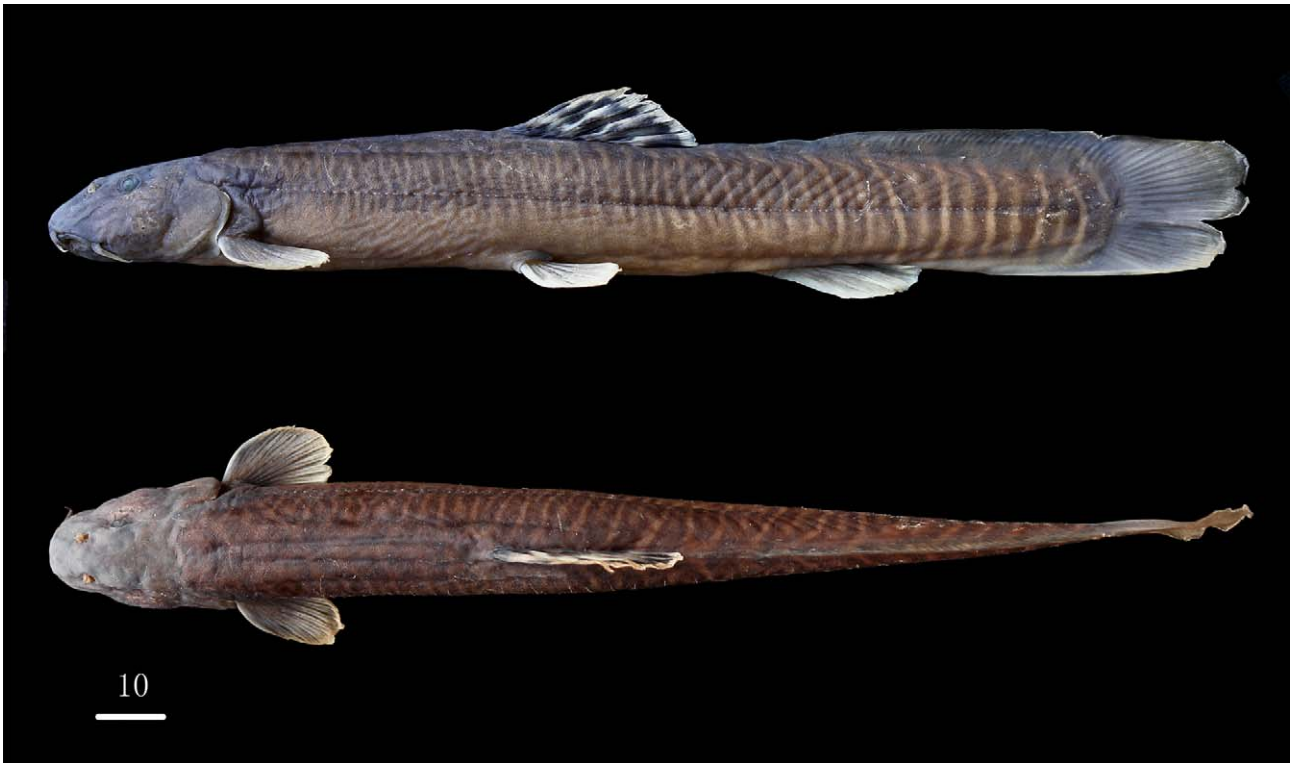
FIGURE 1. Homatula wuliangensis (holotype, KIZ 2008008158, 181.9 mm SL): lateral and dorsal views.