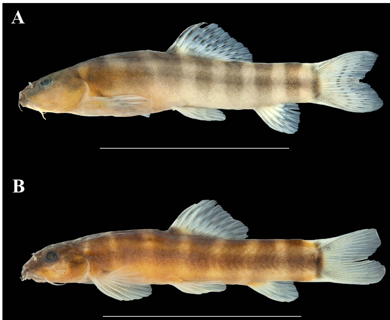
FIGURE 3. (A) Schistura desmotes (UF 183066, 42.8 mm SL) from Ping River, Chiang Mai Province. (B) Schistura sexcauda (UF 181155, 43.1 mm SL), Kwai Noi River system, Kanchanaburi Province. Scale bars = 30 mm.