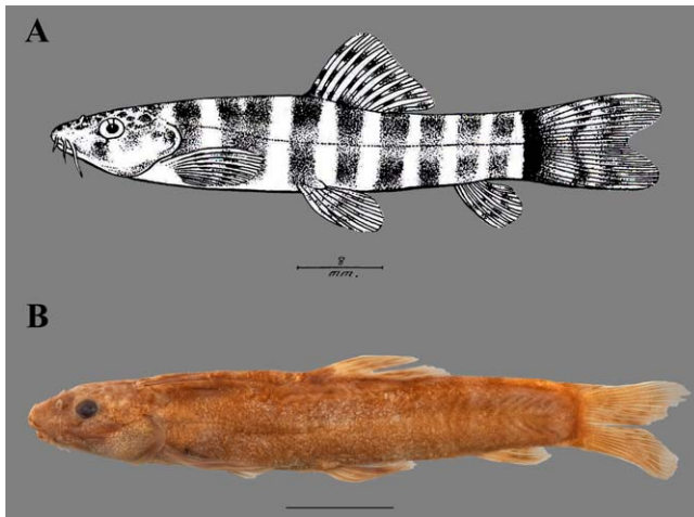
FIGURE 1. Holotype of Schistura myrmekia (ANSP 63546). (A) Original drawing by Fowler (1935) and (B) recent photograph (scale bar = 10 mm).