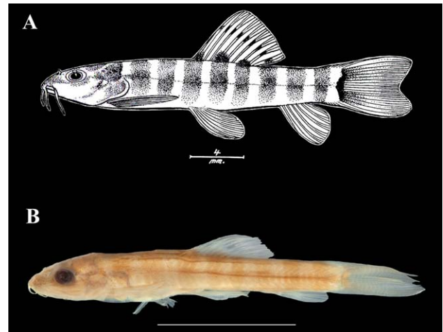
FIGURE 2. Holotype of Schistura desmotes (ANSP 60082). (A) Original drawing by Fowler (1934), and (B) recent photograph (scale bar = 10 mm).