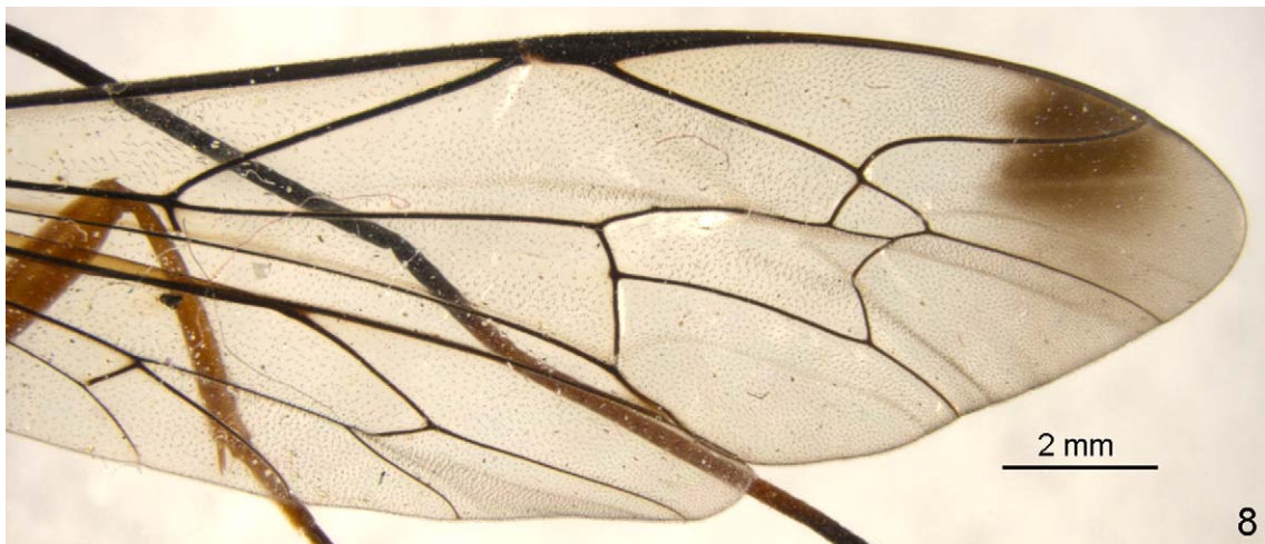
FIGURE 8. Megarhyssa gratiosa sp. nov., holotype, ♀: wings, dorsal.