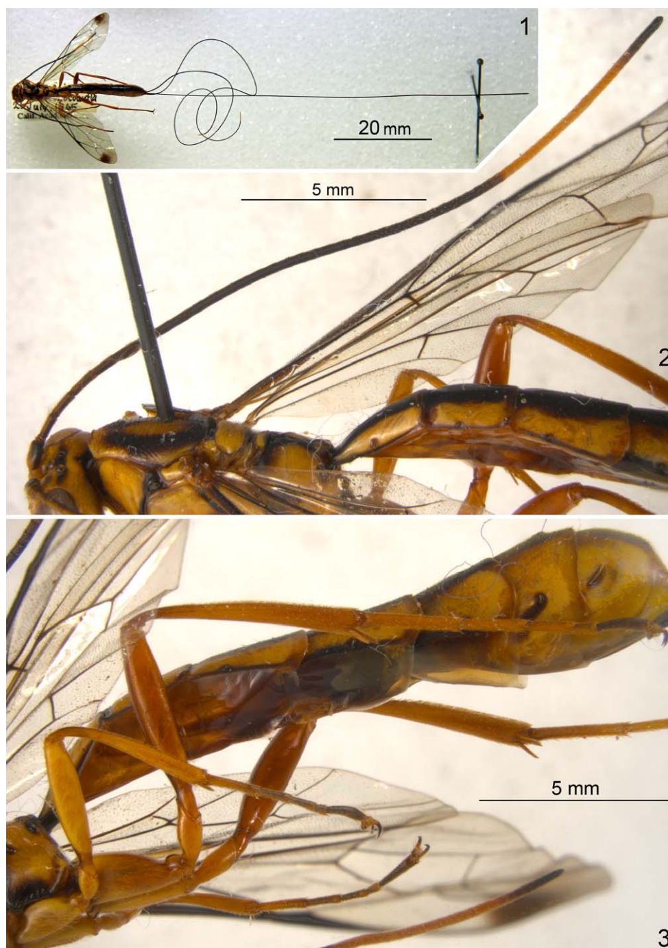
FIGURES 1–3. Megarhyssa gratiosa sp. nov., holotype, ♀: 1—habitus, dorsal; 2—antenna, dorso-lateral; 3—mid and hind legs, ventro-lateral.

hyaline fore wing with a conspicuous dark spot at apex of the radial cell (Fig. 8), and from M. verae , also in having 56 flagellomeres (only 36 flagellomeres in M. verae ) and a shorter malar space.